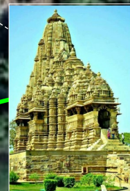
Matangeshwar Temple D&M PENTAGON