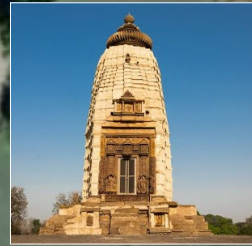
Parvati Temple FACE OF ALA-LU

The purpose of this study is to present the evidence that the geometric ley-lines of the following temple layout is set to the Cydonia, Mars ley-lines. Pertaining to the Cydonia, Mars anomalies, there are 3 main pyramid structures that comprise the Martian Motif . There is the famous Face of Mars , the giant Pentagon Fortress and the Pleiadian Pyramid City . These 3 structures triangulate each other and would make up the core of a large metropolitan city on Earth. What is astonishing is that such a Martian Motif is seen implemented in the architecture of almost all the ancient civilizations on Earth. This started, at least based on the archeological record after the Flood of Noah with Babylon and Sumer. How the Martian Motif is tied to the ley-lines of ancient cities, temples and structures is that perhaps the lost knowledge and connection of the Martian civilization was conveyed to the few and selected 'priestly' class on Earth that constitutes the Secret Societies, etc. This special class of humans are perhaps tasked at keeping the legacy, lifeline and bloodline operational. Even now in the modern era, the same Cydonia, Mars motif is incorporated into the major capitals.