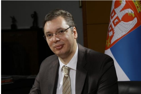
Serbian President Aleksandar Vucic

this kind of a more serious process,” concluded Vucic. (www.b92.net)