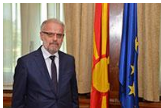
Parliament Speaker, Talat Xhaferi

F.Y.R.O.M ended six months ago. According to Xhaferi, the leaving of Government by the Alliance of Albanians (Aleanca për Shqiptarët) will not cause any waves to the parliamentary majority, and the quorum in Parliament does not depend on it. “I am sure that there will be a majority in 2018, all political parties will participate in Parliament, which will lead to a positive report from the European Commission in April and a date for starting pre-accession negotiations”, Xhaferi said. (www.mia.mk, www.meta.mk)