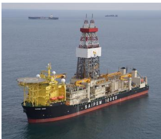
SAIPEM 12000 deepwater drillship

CYPRUS: December 28 th , the SAIPEM 12000 deepwater drillship has arrived at the target in block 6 where later this week it is scheduled to commence drilling an exploratory gas well. The drillship has been leased by the consortium of ENI and TOTAL which have the license for block 6. Turkey which does not recognize the Republic of Cyprus, claims that block 6 partially falls within the outer limits of its continental shelf in the Eastern Mediterranean. The operations in block 6 are expected to wrap up by early February 2018, after which the drillship will almost immediately head to block 3 – also licensed to ENI – for another exploratory drill. The target in block 3 is codenamed ‘Soupia’ (cuttlefish). Also on December 26 th , 2017 the Turkish research vessel BARBAROS HAYREDDIN PASA set a course for the Cypriot Exclusive Economic Zone (EEZ). (www.cyprus-mail.com)