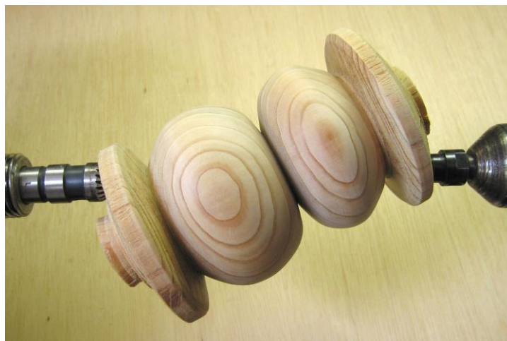
Second Axis mounted

Second Axis: Several options exist for placing the box on the second axis. Placement of the drive and tail stock will determine the shape of the final box. Rotation of the axis will determine the degree of final shape. Having the second axis in the same plane will produce one shape while rotating the axis will produce a different final shape.