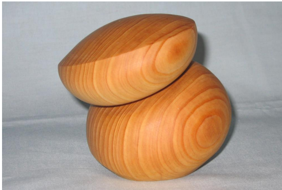
Finished box of Western Cedar (3.5" D X 4" H)

Credit to Remi Verchot for ideas on this concept