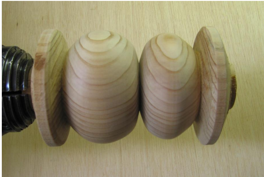
Finished box on first axis

This is the completed lidded box on the first axis. Remember to do all sanding when you have finished shaping the base and top. This is the last time for this finishing step.