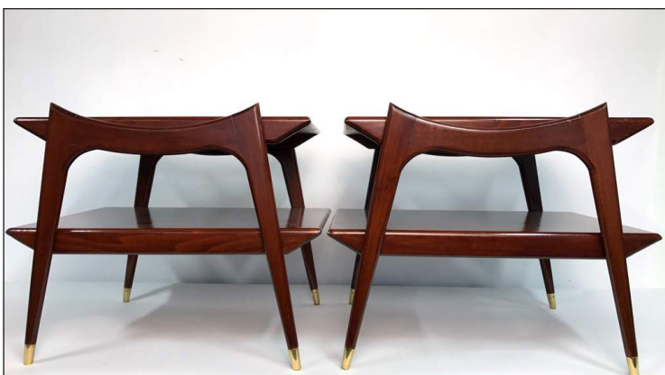
A pair of Midcentury Modern-style end tables finished at $953.