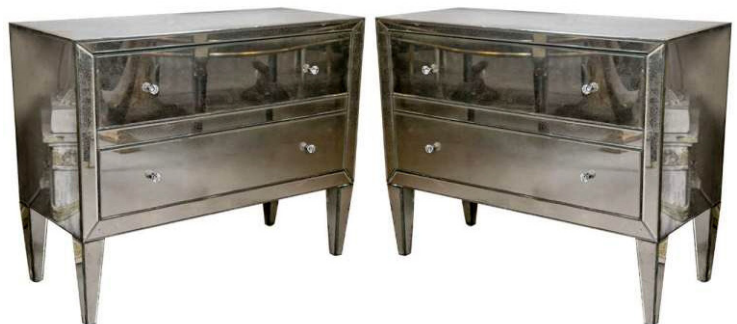
A pair of mirrored two-drawer Judy commodes changed hands at $1,905.