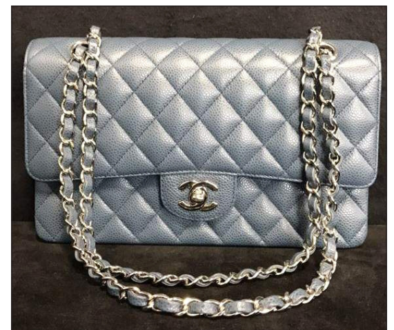
Never used, this Chanel bag drew a winning bid of $3,175.