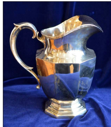
This Black Starr & Frost sterling silver pitcher, circa 1940s, was $477.