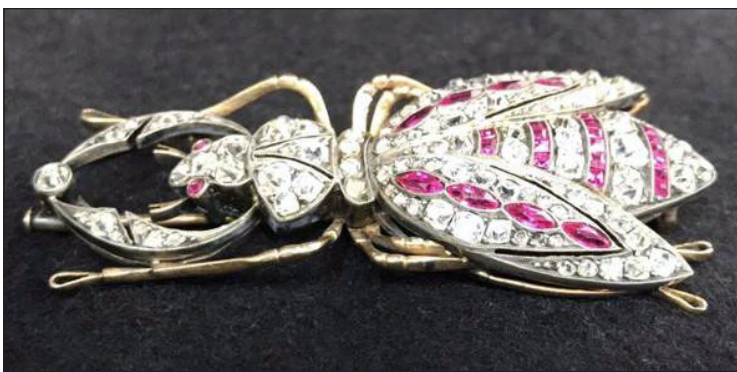
This diamond and ruby bee brooch, circa 1880s, took $2,286.

There will be more stocking stuffers and holiday gifts at the firm's December 14 auction. For information, 914-864-0707 or www.thebenefitshop.org .