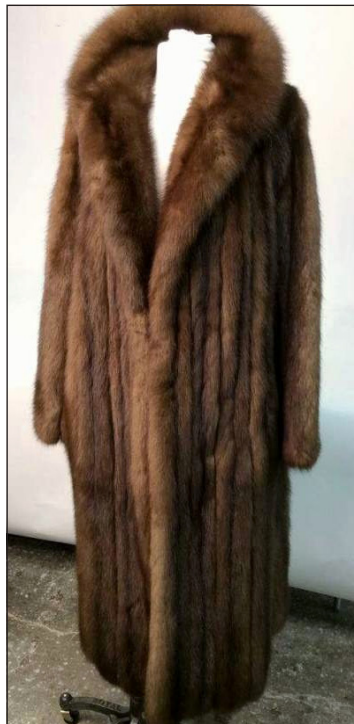
Topping the day's lots was this vintage Russian sable fur coat selling for $8,890.