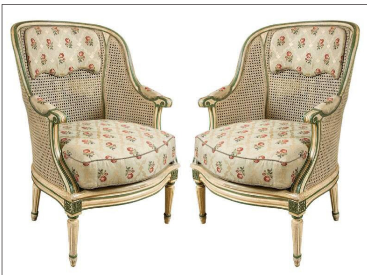
Bidding ended at $1,143 for a pair of Bergere chairs in the style of Louis XVI.