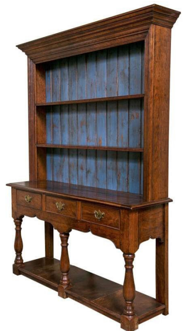
This Nineteenth Century English provincial open-front cupboard brought more than $1,200.