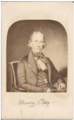
Henry Clay (1777-1852)

According to the 12 th Amendment rules, the choice of president now falls into the House of Representatives, which meets on February 9, 1825, to decide the outcome. Each state will cast one vote for the winner within their caucus. Since there are 24 states in total, a candidate must take at least 13 to be elected.