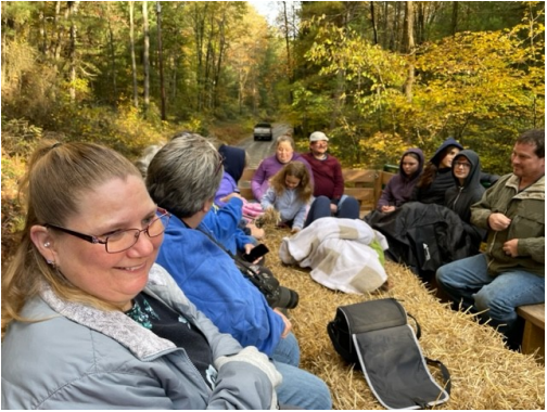
Always fun on a cold Hayride. Come and Join in the FUN!