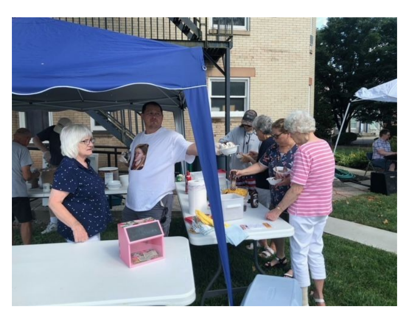
More Ice Cream Social Drum Circle for Vacation Bible School