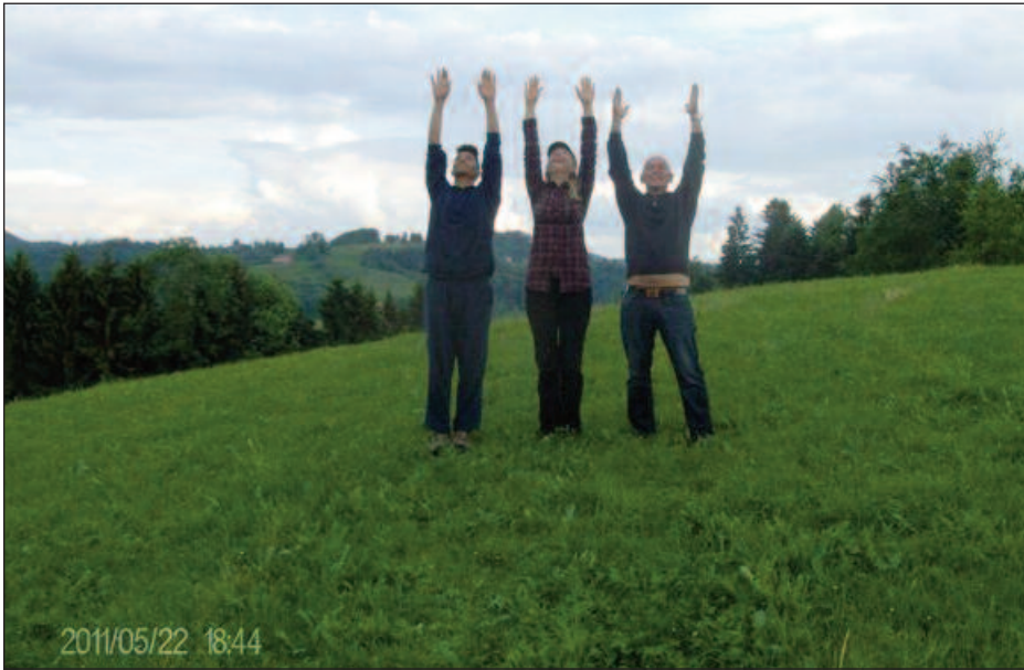
HAVING FUN "BEAMING UP" AT SÄDELEGG, SCHMIDRÜTI / MAY 22, 2011