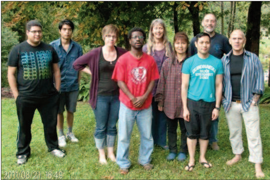
FIRST ANNUAL FIGU-LANDESGRUPPE CANADA MEETING / AUG. 21, 2011