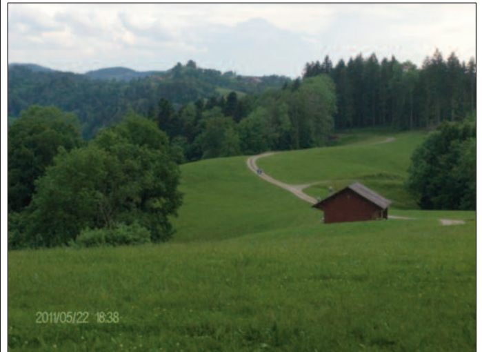
MAY 22, 2011