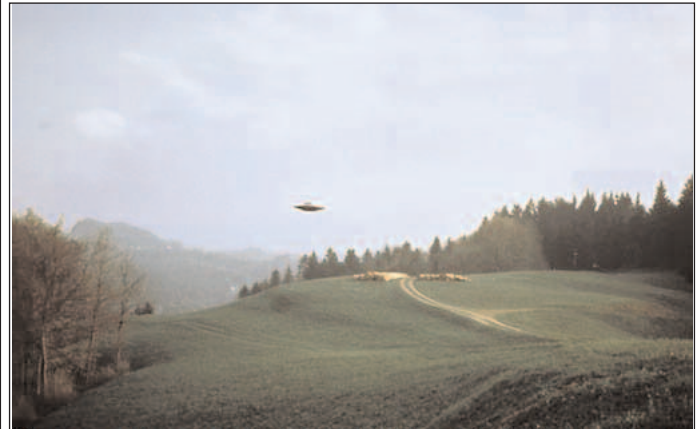
Nr.494: 8. März, 1975; Hintere Sädelegg, Schmidrüti