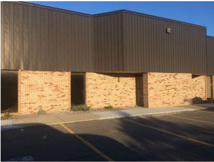
taylor trade center 2