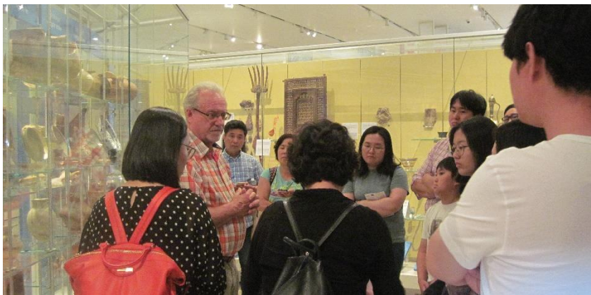
Here, we get a look at Middle Bronze Age pottery, including cooking kraters and oil lamps from the time of Abraham.

On one evening, I was honored to speak in the campus Tuesday “Gathering” in