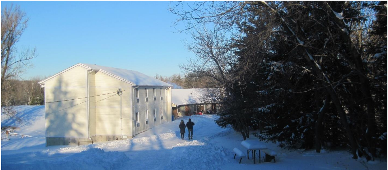
It was definitely cold and snowy in Toronto in January. However, the apartment for guest lectures was toasty warm.