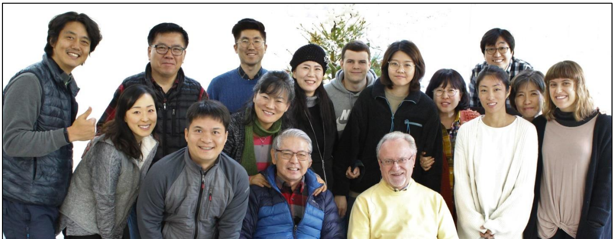
This is my biblical studies group at the Seattle campus. As you can see, they were mostly 20-somethings, though the gentleman seated next to me, a Presbyterian student, was closer to my age.