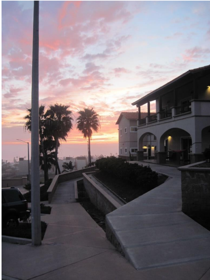
The campus at San Antonio del Mar, Mexico is truly lovely, situated on a hill overlooking the Pacific. Here you can see a bit of it as the sun sets in the West.