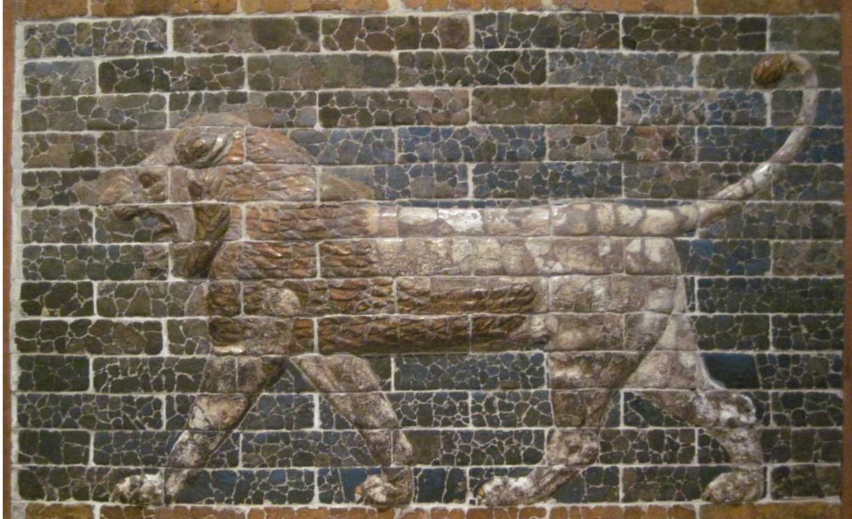
This lion, composed of glazed bricks, once graced the throne room of Nebuchadnezzar II, the Babylonian king who destroyed Solomon's temple. According to the book with his name, Daniel was in this very throne room when interpreting the king's dream and would have seen this lion.