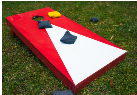
At left, a photo of cornhole, a game anyone can play.

Please bring your personal picnic edibles. We will provide water, iced tea, and lemonade.