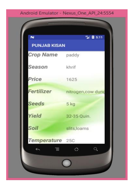
Fig.4: Crop Information display on Punjab Kisan App

seed, pesticide and fertilizer. The new machinery implemented in agriculture is easily detected which may available at limited stores.