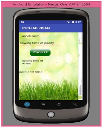
Fig. 5: Asking Farming Query from Agriculture Expert