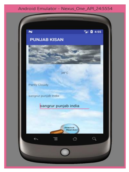
Fig. 3: Weather Forecast Display on Punjab Kisan app

(ii) BEST PRICE: Punjab Kisan app has an option of Best price that deliver the market price of selected crop across the markets. It facilitates the farmers in a great way because farmers are generally uninformed about the actual price of crop across the markets. In this matter they are dependent on mouth to mouth transferred information. Therefore, they sell their crops through agencies. Through 'Punjab Kisan' price of selected crop is supplied according to the chosen mandi and district name of the farmer.