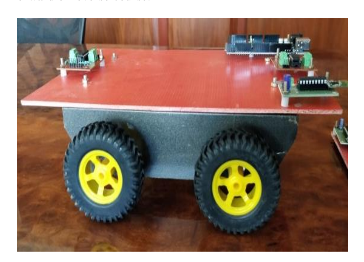
Fig.1 Robotic platform

The entire project consists of the robotic platform and a remote that is used to control the robot. The robotic platform is manufactured from Fibre Reinforced Polymer (FRP) material. The chassis is made from MS. The FRP is used in order to avoid conduction of electricity through the platform and also to avoid short circuit condition. The idea is that the robot works underground along with the cable and detect the fault occurred. An opening would be dug in order to let the robot in the underground trench; the robot will then be driven down the trench and will detect the fault on the way. A mixture of variety of sensors is installed on the crown of the robot in order to indicate the fault occurred. All these sensors are all interfaced to the microcontroller chip that is programmed to control all the robotic occupation. Any fault detected will be indicated by buzzer and also it is indicated on the display screen. The remote that is used to manage the performance and working of the robot used consists of microcontroller, trans-receiver, LCD display and a keypad. The keypad will control the path of the robot; it can make the robot go in forward course or in reverse course. The fault that is occurred is demonstrated on the Liquid Crystal Display (LCD) screen that is set up on the remote. DC motor is used on each wheel of the robot to steer the robot in forward or reverse course.