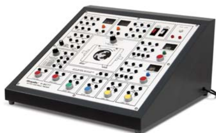
Dimensions: 12"H x 24"W x 24"D Shipping Weight: 90 lbs.