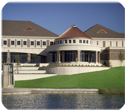
Moore-Norman Technology Center – South Penn Campus

Konawa Public Works Authority | Savanna Public Works Authority | Ellis County Rural Water District No. 1 | Garfield County Rural Water District No. 5 | Beckham County Rural Water, Sewer and Solid Waste Management District No. 1 | Muskogee County Rural Water District No. 5 | Logan County Rural Water, Sewer and Solid Waste Management District No. 1 | Pottawatomie County Rural Water District No. 3 | Marshall County Water Corporation