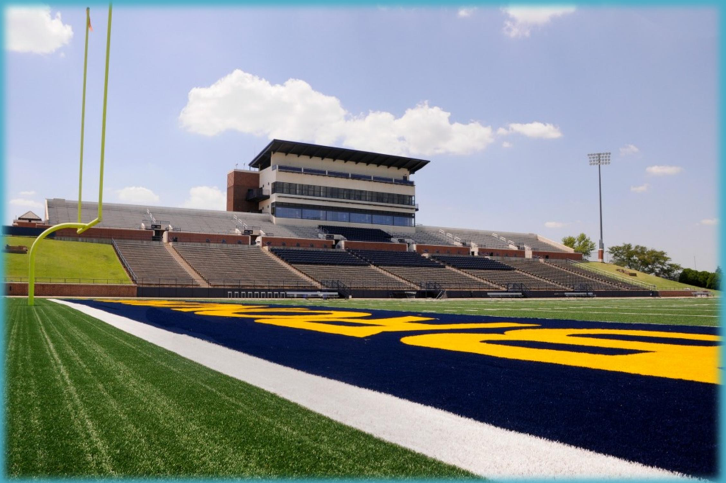
Wantland Stadium University of Central Oklahoma

118 East Main Street Post Office Box 396 Norman, Oklahoma 73070-0396 Tel: (405) 364-6660 Fax: (405) 360-5076