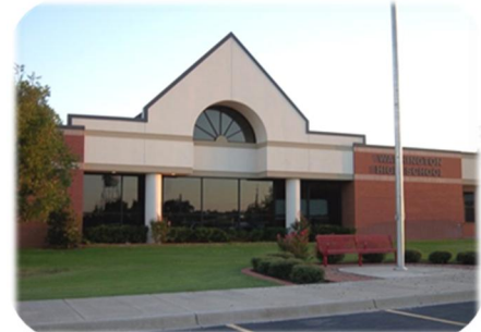
Washington High School – Washington

Luther Public Schools | Pauls Valley Public Schools | Amber-Pocasset Public Schools | Mid-Del Public Schools | Shattuck Public Schools | Hydro-Eakly Public Schools | Merritt Public Schools | Jones Public Schools | Stroud Public Schools | Bridge Creek Public Schools | Blanchard Public Schools | Purcell Public Schools | Chickasha Public Schools | Bethel Public Schools | Lone Star Public Schools | Weatherford Public Schools | Hobart Public Schools | Roland Public Schools | Blackwell Public Schools | Thomas-Fay-Custer Public Schools | Millwood Public Schools | Muskogee Public Schools | Salina Public Schools | Harrah Public Schools | Minco Public Schools | Morrison Public Schools | Jay Public Schools | Tecumseh Public Schools | Elgin Public Schools | Moore-Norman