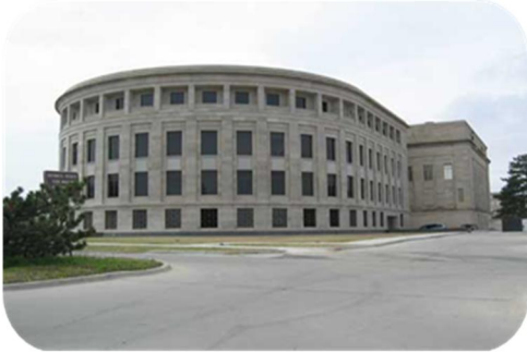
Oklahoma Supreme Court Building – Oklahoma City

Oklahoma Department of Transportation | Oklahoma State Bureau of Investigation Building | Oklahoma Supreme Court Building | Native American Cultural Center | Oklahoma Historical Society | J.D. McCarty Center | State Authority issued Master Lease Program for Colleges and Universities | State Authority issued Higher Education Program for Colleges and Universities | State Authority issued First Time Farmer Program | Oklahoma Department of Agriculture, Food and Forestry | Oklahoma Department of Corrections | Oklahoma Department of Human Services Office Buildings | Oklahoma State Election Board | Oklahoma Conservation Commission