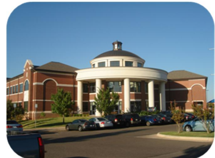
University of Central Oklahoma – Wellness Center

The University of Oklahoma – Multi-Tenant Office Facility | The University of Oklahoma Research Facilities | The University of Oklahoma Gaylord Family Stadium | The University of Oklahoma Student Housing | The University Of Oklahoma Health Sciences Center Utility System | The University of Oklahoma Health Sciences Center (Cancer Center) | The University of Oklahoma Health Sciences Center Schusterman Center | Carl Albert State College Dormitories and Housing | Rogers State University Student Services Center | Seminole State College Student Housing | Oklahoma State University Student Housing | Oklahoma State University Alumni Center | East Central University Fine Arts Center | East Central University Student Housing | University of Central Oklahoma Wantland Stadium | Southwestern Oklahoma State University Student Center | Oklahoma Panhandle State University Student Housing | Cameron University Student Housing