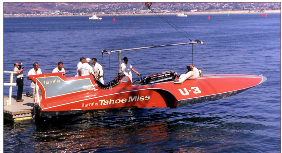
Harrah's Tahoe Miss, the 1966 National Champion

There were 24 unlimited hydroplanes registered for the 1966 campaign, and 22 of them scored points on the 11-race circuit. The 1966 season featured the Suncoast Cup in Tampa, Florida; the President's Cup in Washington D.C.; both the Gold Cup and Horace Dodge Memorial in Detroit; the British Columbia Cup in Kelowna, B.C.; the Atomic Cup in Tri-Cities, Washington; the Seafair Trophy in Seattle; the Diamond Cup in Coeur d'Alene, Idaho; the Governor's Cup in Madison, Indiana; the San Diego Cup in San Diego; and the Sacramento Cup in Sacramento.