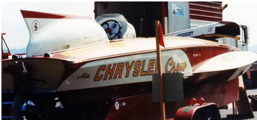
The oldest and newest boats in the 1966 fleet. Pictured at the top is the former Gold Cup champion Slo-mo-shun V as it appeared in its final year of competition. At the bottom is the Miss Chrysler Crew, a new boat powered by Chrysler Hemi engines.

The high points champion for 1966 was the U-3 Tahoe Miss (#6403), with four race victories and two additional podium finishes. Tahoe Miss also won the Gold Cup in Detroit. The U-15 My Gypsy , finished second in the high points with only one win in Seattle and three additional podium finishes.