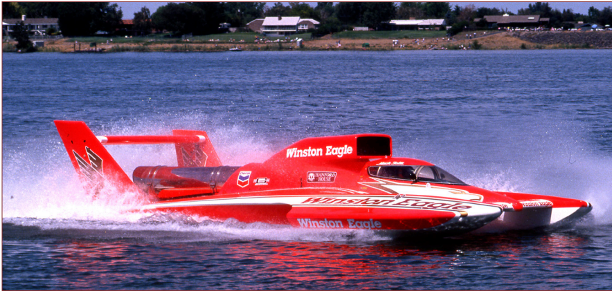
Pictured at the top is the Miss Budweiser, the 1991 National Champion. Finishing second in the standings was the Winston Eagle (above).

The boats appeared in Honolulu for both the first race of the season and the last. After completing the 1990 campaign, the boats were loaded onto a container ship in California and moved to Hawaii to compete in the Pearl Harbor Hydrofest. Because the race occurred on November 16 (the APBA year runs from November 1 to October 31), it was technically the first race of the 1991 season. The boats were then shipped back home to undergo their usual winter repairs and renovations.