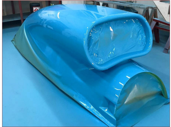
Miss Madison Facebook Page