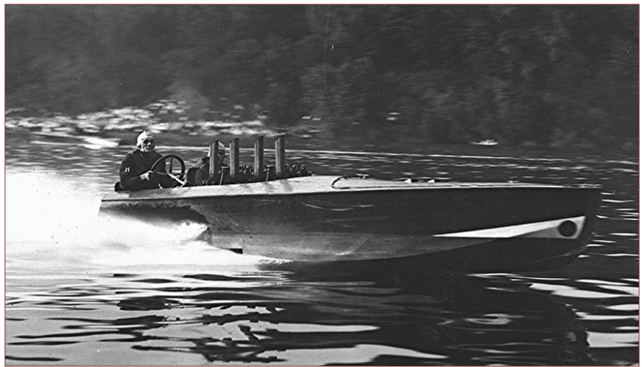
Algonac-Clay Township Historical Society and Museum