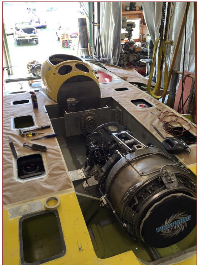
Bucket List Facebook Page