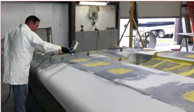
U-27 Facebook Page Photos