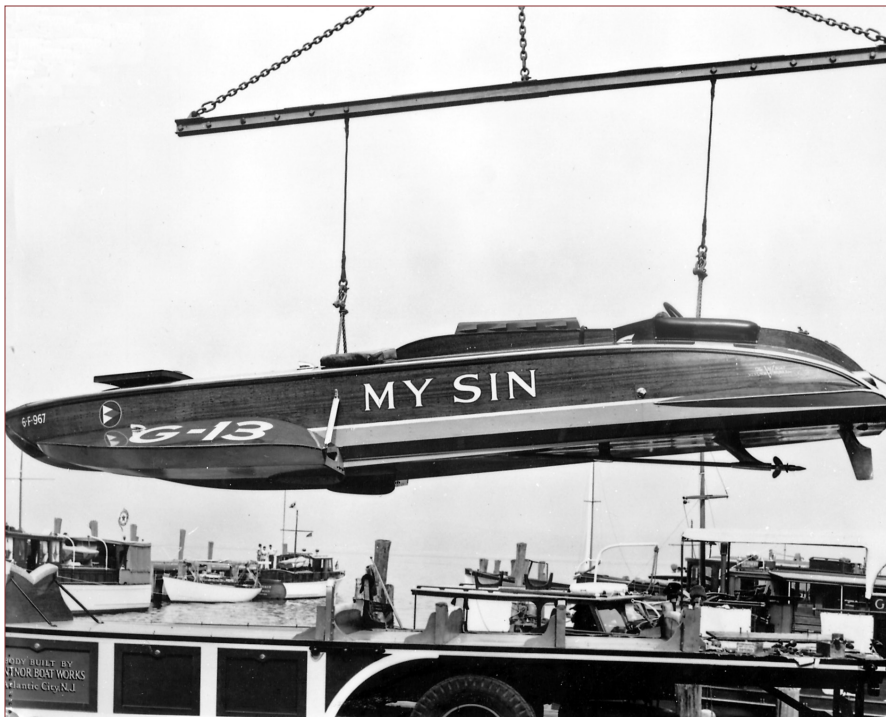
My Sin, the 1939 and 1941 Gold Cup champion

became less than a priority. Events in Detroit and Washington, D.C. were canceled in an effort to conserve gasoline. Yet, the Gold Cup was held as scheduled at Red Bank, New Jersey, in conjunction with the annual National Sweepstakes Regatta, which attracted large fields of competitors for the smaller inboard classes.