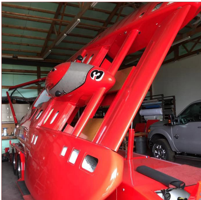
Go3 Racing Facebook Page

Ed Cooper's "turbinator" is in the shop awaiting the crew to begin some minor hull work and prep for the 2016 race season. Sponsor search is still underway.