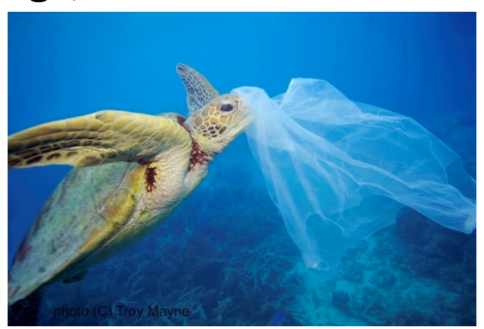
The picture below is what made me decide to write the story of Tuamor the Turtle...