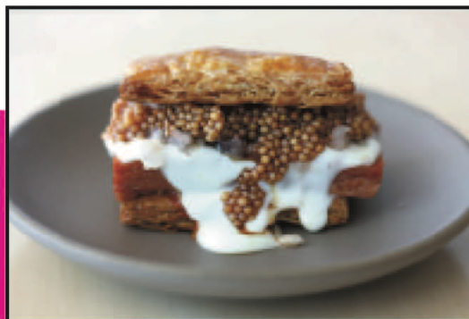
Pig in a Blanket

SMALL friendly Italian restaurant in the very hip Silver Lake area of Los Angeles. Zach Pollak (from the famous Sotto restaurant) brought us small plates of moderately priced Italian dishes and we were seated at the light wood tables, where we checked out the view of many tres sexy singles who were sitting at the bar. The delightful aroma that was coming from the kitchen made our starving stomachs growl like raccoons in heat. For our starters we immediately ordered the PIG IN A BLAKET — mortadella, spelt pastry, brovado, stracchino, the tiny little mustard seeds and tomato jam between the buttery flaky spelt pastry made this dish superb, and the delicious CHOPPED SALAD "amigliorata" tres fresh! Our entrees were the SQUID INK RADIATORI — red wine braised squid, mussels, peas, dried tomatoes — was so delicious it made us tipsy with its exquisite flavors. WHOLE WHEAT BIGOLI — summer tomato, pinenuts, crema acida, totally stimulated our senses and the scrump FUSSILI — cockles, fava leaves, serranos, smoked butter, a bit spicy and a lot fabulous. This intimate, cozy, white wall dining room is a great place for family celebrations, anniversaries and especially first dates where you can share a mouthwatering dessert such as the CHOCOLATE BUDINO — layered caramel, whipped cream, and sweetened bread cubes — all over a warm sugary first kiss. Bon Appétit!