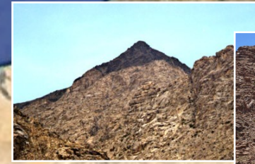
At Foot of Mount Sinai, in Arabia.

360 Nautical Miles - Ground Length 60 Day Journey - 6 Mile/ Day