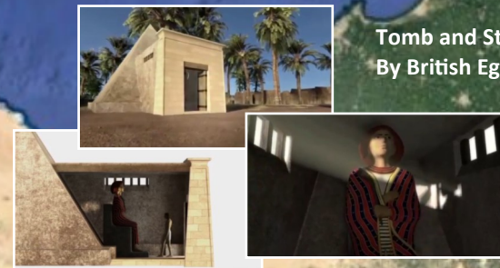
Tomb and Statue of Joseph in the Land of Goshen. By British Egyptologists and Scholar David Rohl.

The purpose of this illustration is to depict the Exodus Journey of the Israelites from Egypt to the Foot of Mount Sinai. According to Galatians, the Mountain is in Arabia. Using Google Earth, the Ground Length determined to encompass this Journey comes out to exactly 360 Nautical Miles. It is presumed that the Exodus commenced with the extraction of Joseph's Bones and others that are said to have lived in the Land of Goshen. In particular, the place called Tell el-Daba is where Egyptologists Rohl has unearthed and reconstructed the Statue of Joseph. The Bible states that the 'Army' of the Israelites left after 430 Years, to the Day. It was the day after the 1 st Passover, Nisan 15. The Bible states that they arrived at the Foot of Mount Sinai on the 15 th of Sivan. It is from there that it took a total of 40 Days thereafter for Moses to then return with the 'Hard Copy' of the 10 Commandments. However, this Day was the 50 th and the cause for the Golden Calf event. This suggests that this day was Pentecost, the 50 Days counted after the 7 Sabbaths from the Feast of Unleavened Bread. Thus the Rabbinical Tradition that the Israelites arrived on Sivan 1 and then the Law was given on the 8 th of Sivan is not correct.