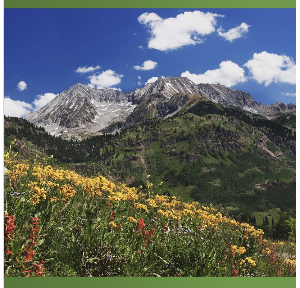
In Partnership with Western Colorado University, Center for Public Lands