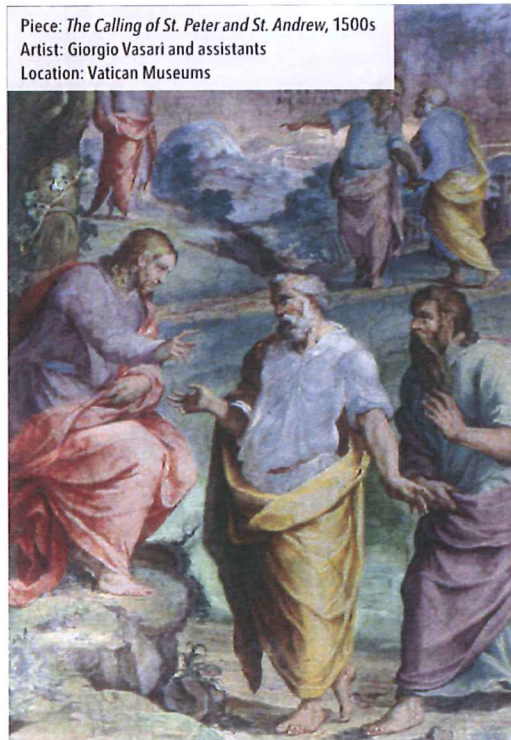
Piece: The Calling of St. Peter and St. Andrew , 1500s Artist: Giorgio Vasari and assistants Location: Vatican Museums