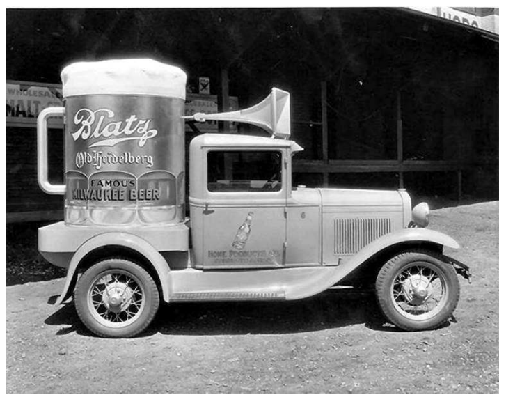
How about a cold one?

There are more collect calls on Father's Day than any other day of the year.