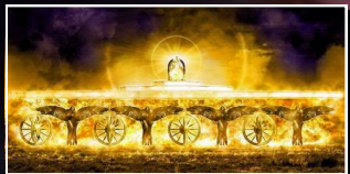
THRONE OF YHWH

There are many who believe that ORION is the gateway to the actual dwelling place of the Creator. If ORION is a 'gate' or portal into such a dimension, it would explain why in particular, Jerusalem is layout with such exacting attributes. The city's gates correspond to the major stars, the Temple Mount 3-Domes corresponds to the 3-star belt alignment.