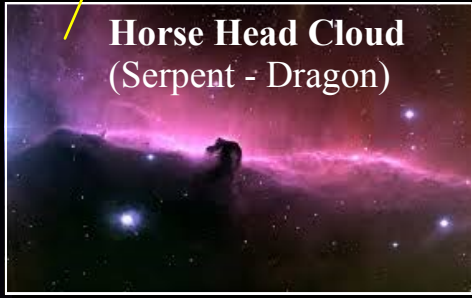
The Heavenly Temple - Jerusalem - Zion - Orion