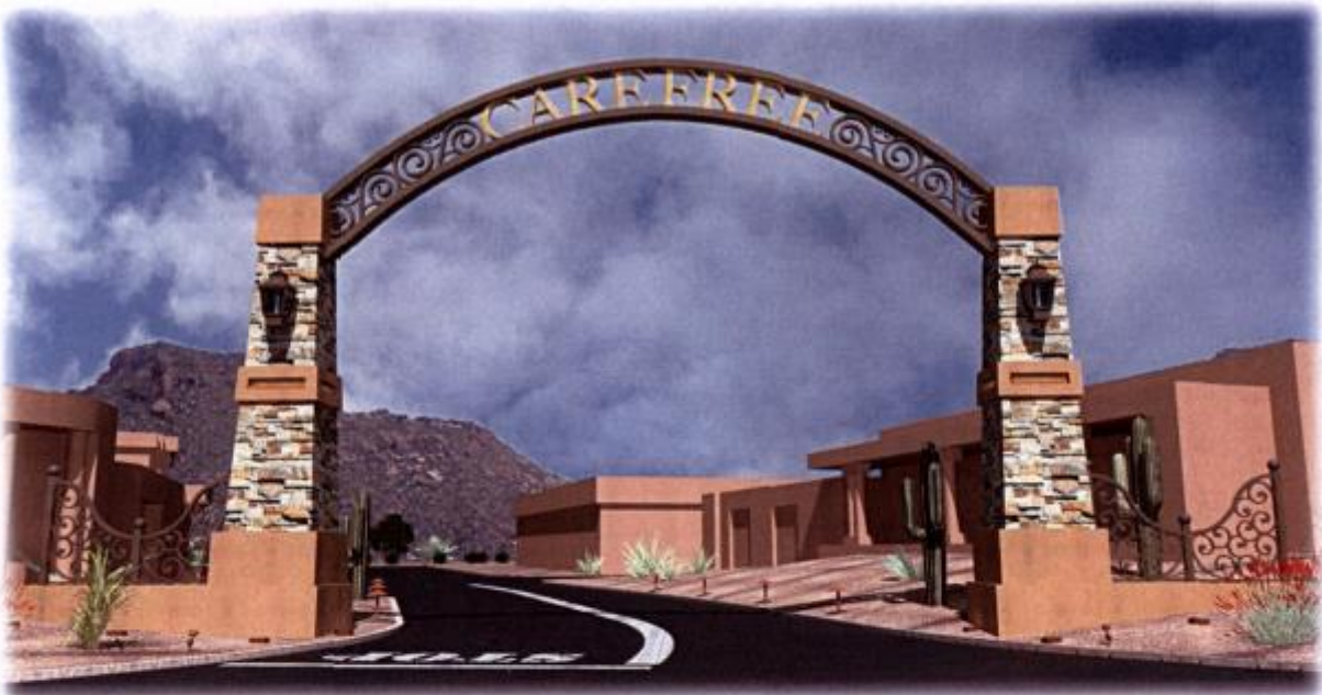
Future Primary Gateway Design

Item 14, Discussion regarding design for Town Center Gateways: Town Administrator Gary Neiss presented the design(s) for both the larger gateways (facing the arterial roadway(s) as well as the interior or secondary gateways (8 feet tall by 4 feet wide). The design(s), which blend a Spanish Colonial and Contemporary appearance, will have out-facing faux gas lamps (similar to the existing lamps within the core) and will provide LED backlighting where appropriate for readability at night.