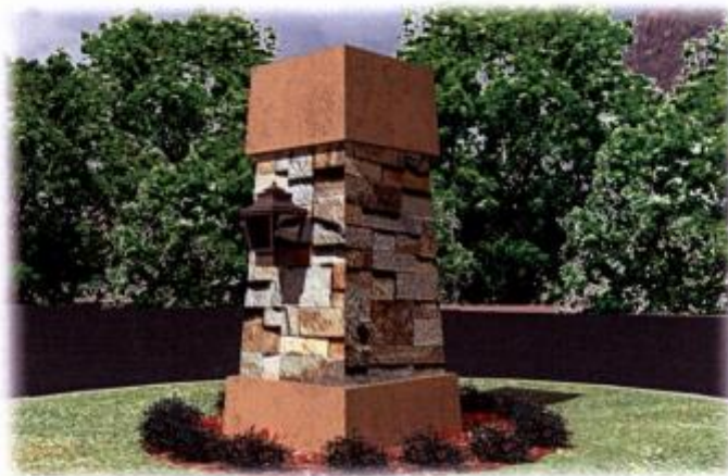
Future Secondary Gateway Design