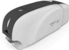
Dual sided ID CARD PRINTER smart-31D