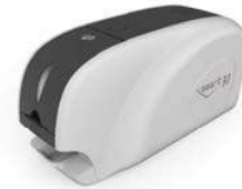
Rewritable ID CARD PRINTER smart-31R