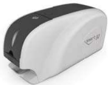
Single sided ID CARD PRINTER smart-31S