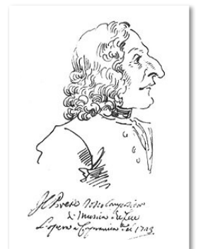
Caricature by Pier Leone Ghezzi

The women of Cantores Celestes are working very hard to do justice to these two fabulous works.