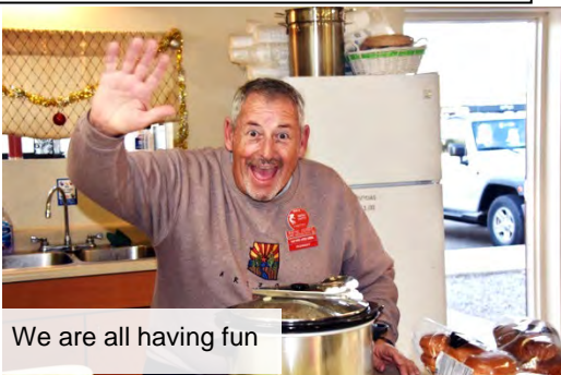
We are all having fun

own to tour Quartzsite. The hosts suggested visiting the Hi-Jolly Memorial, Daniels Really Good Jerky, Gunny's Military Museum, and Read's Oasis Books.