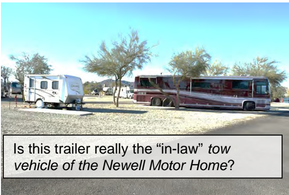
Is this trailer really the "in-law" tow vehicle of the Newell Motor Home?

Saturday morning started with a pancake breakfast put on by the park. Today, everyone was on their