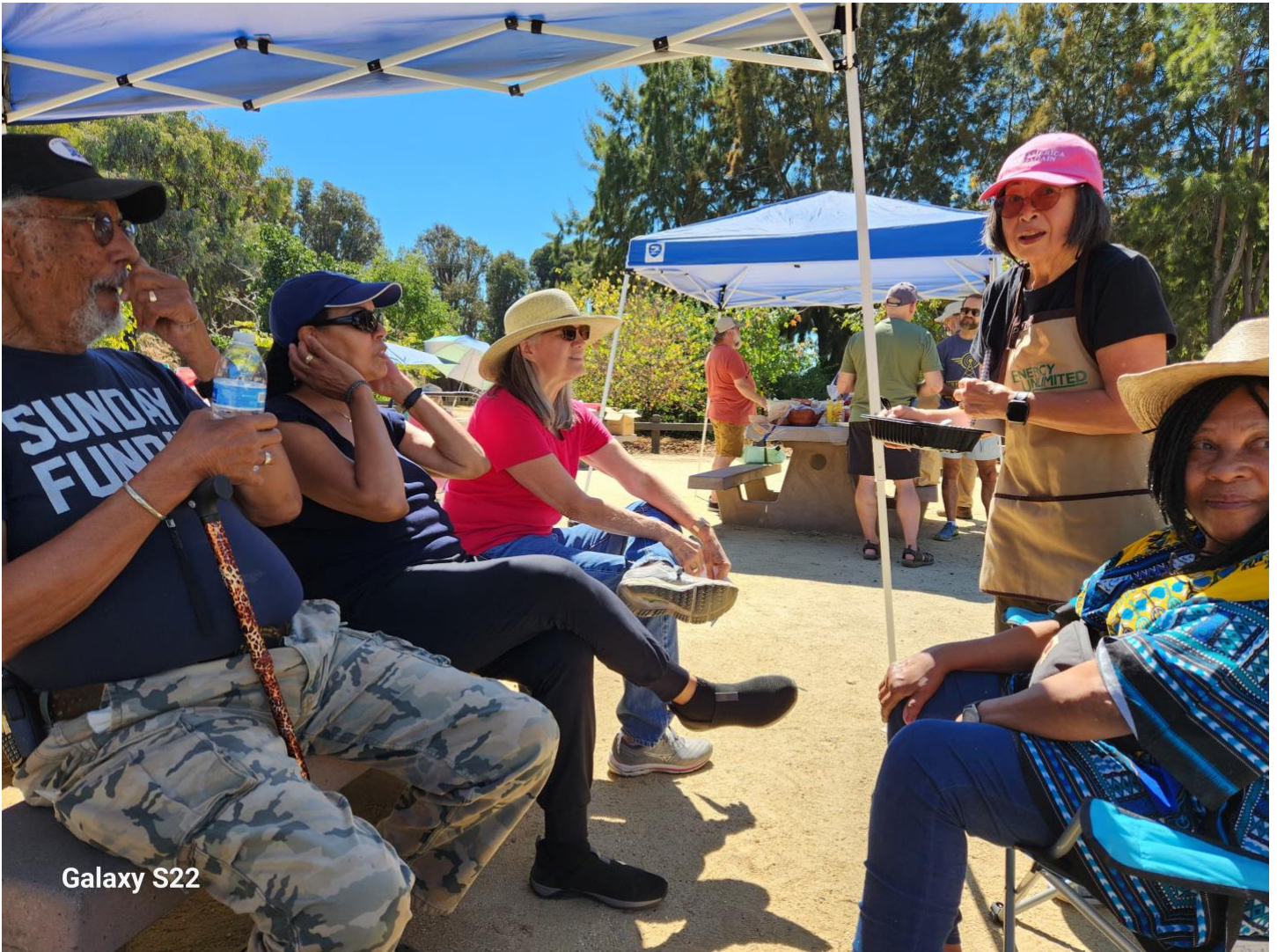
Picnic photos