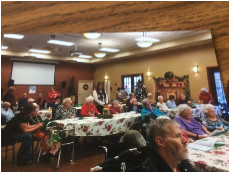
Part of Ct. St. Cecelia's Christmas program at nursing home.