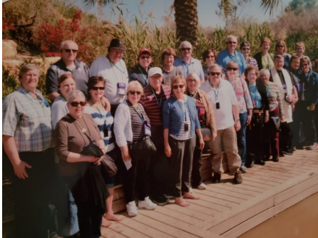
[The traveling companions]

We visited the rest of the Stations while we were there. Saw where Jesus was crucified, the stone that He was laid on, and went in His tomb. From there we went to the Mount of Olives, where Jesus taught the disciples the Lord's Prayer. Then to the Chapel of the Ascension, where Jesus ascended into heaven, the Tear Chapel, where Jesus wept for Jerusalem, and we saw Mount Zion and Mount Moriah, where Abraham's sacrifice of Isaac took place.