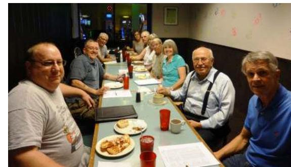
What Happens in a Board Meeting Stays in a Board Meeting