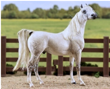
TECH NOIR II (AI) ~ Arabian stallion ~ CM by unknown in the 1990s