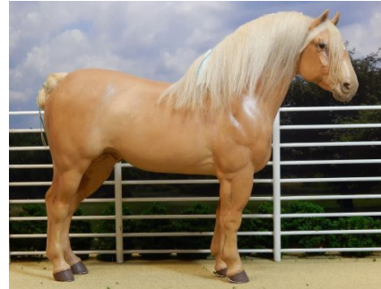
Flocked w/Haired or Other Non-Flocked Mane/Tail (1): 1-Tug Hill By Request (CM)

Remade & Flocked with Flocked Mane/Tail and Remade & Flocked w/Haired or Other Non-Flocked Mane/Tail: none