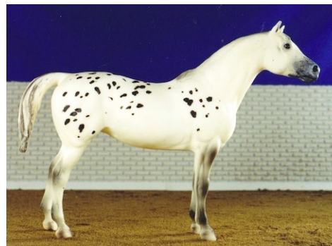
CHAMPION CUSTOM W/FACTORY PAINT: BLACK HAND (CV)

Remake and Retouch/Partial Paint Removal/Etch on Factory Paint with Non-Factory Mane/Tail: no entries