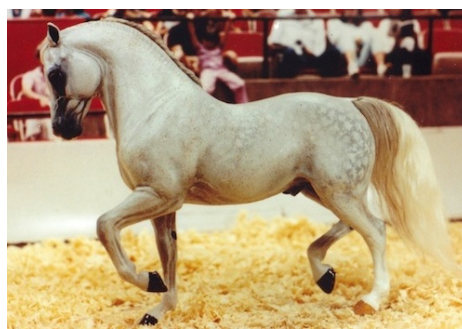
RES. CHAMPION SPANISH BREED: SIGLAVY SEIKO (CV)

American Saddlebred (24): 1-WBP Sweet Expectations (LeB), 2-20th Century Fox (VM), 3-Sultan of Swing (JC), 4-EG Cool as Ice (MH), 5-Operation Meteor (AC), 6-DO Starguard Elite (LeB), 7-