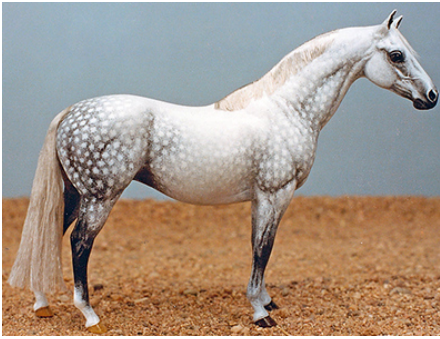
RESERVE CHAMPION SPORT BREED: JETAN'S GLORY (KO)

Paso Fino/Peruvian Paso (9): 1-Tony Harken (AC), 2-Reynarda (AC), 3-En-cantador (CM), 4-ME Bolido (MH), 5-Diamond Majestad (CM), 6-Trueno Azul (CM), 7-Red Sonia (LeB), 8-Danzante (AI), 9-Stephano (MH)