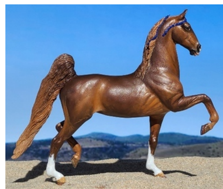
CHAMPION GAITED BREED: WBP SWEET EXPECTATIONS (LeB)

Other Pure or Mixed Gaited Breed (11): 1-Misty Three-Kay (AC), 2-Foxy Moonshine (CM), 3-Sparkling Chablis Z (CM), 4-D.O. National Anthem (MH), 5-Midnight's Mac (CV), 6-TS Autumn Nor'easter (MP), 7-Glitters Like Gold (JV), 8-Ima Travelin' Man (CM), 9-TS Galilean Dragoness (MP), 10-Perfection (MH), HM-Dazzleway (AC)