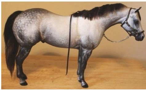
RESERVE CHAMPION STOCK BREED: DAKOTA SHYSTER (LoB)

Arabian (95): 1-Amarna Bint Morafic (CV), 2-Angel Queen (CV), 3-Metropolitan (AC), 4-Fox Maiden (AC), 5-Wings Of Darkness (AC), 6-Sweet Jane (LD), 7-Ryo Asuka (AC), 8-Wings of Desire (KO), 9-Valhallas Tiara (CM), 10-Safari Eyes (CV), HM-So Rare (CV)