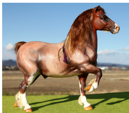
RESERVE CHAMPION DRAFT BREED: ATRAGON (AC)

American Pony (24): 1-RM Winkin' At The Moon (AC), 2-Space Cowboy (CV), 3-Siri's Sly Delilah (AC), 4-Toby Mojave (SC), 5-D's Dakota Frills (SS), 6-Dark Naoto (AC), 7-Rio Lobo (MH), 8-LJ Abby Someone (CV), 9-CLF Raindance (AI), 10-Cricket (MH), HM-Flashy Miss (MH)