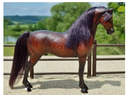
RESERVE CHAMPION LIGHT BREED: WHIPPOORWILL INCOGNITO (BR)