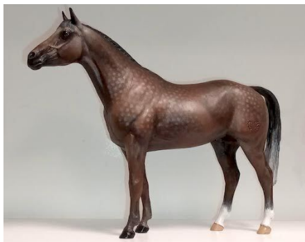
CHAMP GREY/ROAN: ZYLLION (AC)

Roan (4): 1-Poco Graybar (LoB), 2-Steel Master (VM), 3-Eagle Sharp (AC), 4-Strawberry Wine (SS)