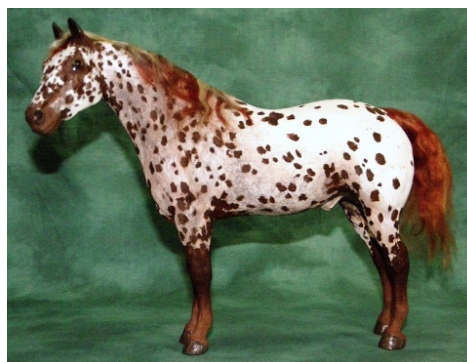
RESERVE CHAMPION SIMPLE REMAKE/REPAINT/HAIR OR SCULPTED MANE/TAIL: DIAMOND RED HAWK (CM)

Major Remake & Repaint with Hair M/T: Trad. or Larger (13): 1-Wickenden Osprey (AC), 2-Indiana Jones (LoB), 3-Ansata Sisu (HR), 4-Brookridge Diamond (LoB), 5-Teleman (LoB), 6-Melulu (CV), 7-Rocking Chair Renegade Revel (CM), 8-Jokers Dice (AC), 9-El Asombro (MH), 10-*Quest (AC), HM-High Chaparral (CV)