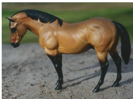
Le Baron (CV), 8-Legends of the Fall (MH), 9-Rowrbazl (AC), 10-Siglav Seiko (CV), HM-Voltes V (AC)

Trad. or Larger (131): 1-RM Pravda (CV), 2-Operation Meteor (AC), 3-Jemez Skystriker (LeB), 4-Master Derby (AC), 5-Second Impakt (CV), 6-Misty Three-Kay (AC), 7-KT