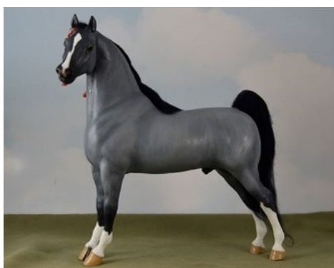
RESERVE CHAMPION GAITED BREED: STONOR EAGLE (EH)

Clydesdale/Shire (19): 1-Brigante (AC), 2-Thunder In Paradise (AC), 3-Megazone Eve (AC), 4-Hylands Cavalier (AL), 5-Foxcroft Lad (LK), 6-Diamonddraught (LeB), 7-Two Ton Tessie (AC), 8-Castlekeep Mistress (LoB), 9-Frostline (LeB), 10-Royal Scam (LK), HM-Mae West (MH)