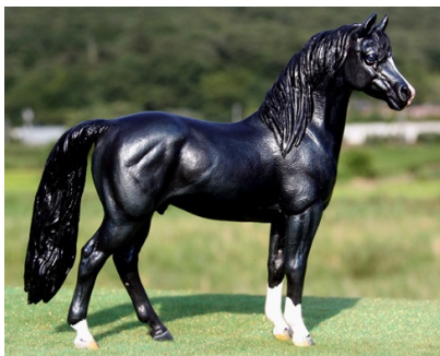
RESERVE CHAMPION PONY/MINI HORSE: SUMMER OF NIGHT (AC)

Longear (14): 1-Bilt to Boogie (SC), 2-Rhubarb Babe (AC), 3-Sunshine's Beebop (HC), 4-Double Dare (MH), 5-Quit Menacing Me (SC), 6-Richard (MH), 7-Shamrock Elfin Magic (SS), 8-Churchy LaFemme (AC), 9-DA Bardiangio Honest John (JV), 10-Cutacross Shorty (MH), HM-CZ Ambrose (JC)