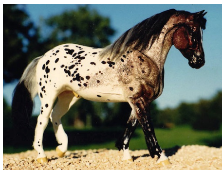
RES. CHAMPION DRAFT BREED: FREUDIAN SLIP (AC)

American Pony (35): 1-Kiwi (LD), 2-Lambchop (LD), 3-Penny Dreadful (AC), 4-Go Varian (AC), 5-Indigo Eyes (AC), 6-Confederate Gray (LoB), 7-Empire's Fudge Sundae (CM), 8-The Paisley Palette (SR), 9-Poco Suavé (HC), 10-PR Doctor Sam (AL), HM-RM The Toy Wonder (CV)