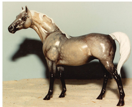
RESERVE CHAMPION REPAINT: OCEAN RAIN (KO)

Repaint with Hair M/T: Trad. or Larger (108): 1-Iron Butterfly (AC), 2-Phantom Lover (CV), 3-Megazone Eve (AC), 4-Glorious Love (LoB), 5-Mara (AR), 6-Lalique (LoB), 7-Mighty Bright J (AI), 8-The Midnight Flasher MB (CM), 9-Wendell Gee (KO), 10-Tawny Wardlaw (LoB), HM-Delight's Elegant Gentleman (CV)