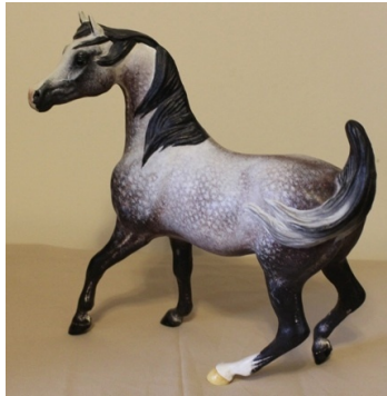
CHAMPION REPAINT: ARAHAEL (LoB)

Evenstar (SR), 2-Banned From Argo (AC), 3-Indigo (KO), 4-En Fuego (CR), 5-Far Horizon (LeB), 6-Vajna (BR), 7-Charisma Cody (LoB), 8-Bito Babe (AC), 9-Deloyer Clarion (CV), 10-Blueberry Smoothie (VM), HM-Arkistas Ring (MH)