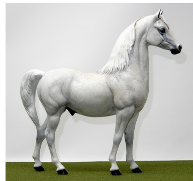
CHAMPION SIMPLE REMAKE/REPAINT/HAIR OR SCULPTED MANE/TAIL: *RAFFLES (CV)

Simple Remake & Repaint with Non-Hair M/T: Smaller than Classic (9): 1-Ice Queen (AI), 2-WBP Frostybytes (LeB), 3-Meghan's Hope (SS), 4-Ziggy (HC), 5-Azle Irongear (AC), 6-McQueen (LK), 7-Star At Rest (AI), 8-ZI Jedi Jetta (AI), 9-Marlayna (SR)