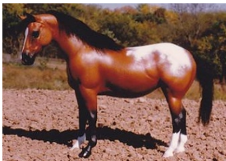
CHAMPION PONY/MINIATURE HORSE: KIWII (LD)

(CV), 3-Millers Golden Boy (AL), 4-Tug Hill Pied Piper (CM), 5-Southern Cross (CM), 6-ZI Kismet (AI), 7-Althea (SR), 8-Candlelyte Memory (AC), 9-Condo Full Colour (AL), 10-FS Snowfell (KO), HM-Northern Fleet (LeB)