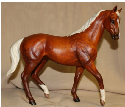
RES. CHAMPION CREAM/DUN COLOR: TOWN CRIER (LoB)

Blanket Appaloosa (17): 1-Lady Jessica (CV), 2-Diamond Playtime (CM), 3-Jack Of Hearts (AC), 4-Cascade Maiden (LK), 5-Lakota Diamond (EH), 6-Wrang Bo Deedy (AC), 7-Jokers Dice (AC), 8-Diamond Seonee (AC), 9-Rocking Chair Renegade Revel (CM), 10-Clovis (CV), HM-Azure Lady (SS)