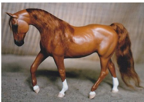
CHAMPION MAJOR REMAKE/REPAINT/HAIR OR SCULPTED MANE/ TAIL: PERSONAL EFFECTS (LD)

Hair Mane/Tail: Smaller than Classic (6): 1-Imagine That (SR), 2-Boris Badenov (CV), 3-Viper Mad Blues (CV), 4-Shez Candu (HC), 5-Bronze Idol (SS), 6-Midnight Monarch (CR)