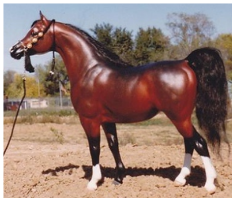
RES. CHAMPION MAJOR REMAKE/ REPAINT/HAIR OR SCULPTED MANE/ TAIL: SWEET JANE (LD)

M/T: Trad. or Larger (162): 1-Sympathy For The Demon (AC), 2-Poltergeist (AC), 3-Turbo Twist (CM), 4-Wolf Typhoon (AC), 5-Sophisticated Boom-Boom (CV), 6-Wings of Desire (KO), 7-Buckthorn Rio (AC), 8-Brigante (AC), 9-Sunshine's P.O. Plenty (AC), 10-The Powerful Katrinka (AC), HM-Calendar Girl (LD)