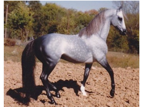
CHAMPION REPAINT/HAIR OR SCULPTED MANE/TAI: CLASSIC GIRL (LD)

Repaint w/Non-Hair Mane/Tail: Smaller than Classic (3): 1-J's Sweetbriar (AI), 2-Remembrance (HC), 3-Remember Me Too (HC)