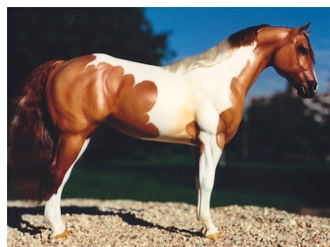
RESERVE CHAMPION SIMPLE REMAKE/REPAINT/HAIR OR SCULPTED MANE/TAIL: MONA LISA OVERDRIVE (CV)

Major Remake & Repaint w/Hair M/T: Trad. or Larger (100): 1-Mars Flash (AC), 2-Crusher Joe (AC), 3-Signature (MH), 4-Lunanegra (AC), 5-Dreams To Dream (JC), 6-East Texas (LeB), 7-Luna Halo (AI), 8-Jettster (AI), 9-Marvelous Marvin (MH), 10-RAS Elian Demoiselle (CM), HM-RAS Zen Amako (AC)