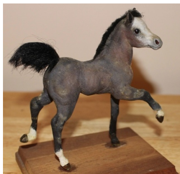
1960s/'70s BREED DIV. OVERALL CHAMPION: WICKENDEN OSPREY (AC)

1960s/'70s BREED DIV. OVERALL RES. CHAMPION: LAKOTA DIAMOND (EH)