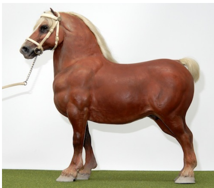
CHAMPION DRAFT BREED: THE POWERFUL KATRINKA (AC)

Other Pure or Mixed Draft Breed (15): 1-Freudian Slip (AC), 2-Matsuko DX (CV), 3-So Czar Ivan (LeB), 4-Galient (AC), 5-Kyrie (SR), 6-Tetsugyu (AC), 7-Flurry of Knox (MH), 8-Diamond Faerytale (AI), 9-Poco Ladybug (CV), 10-Wynstorm Gustaaf (AI), HM-Lady Hadleigh (SR)