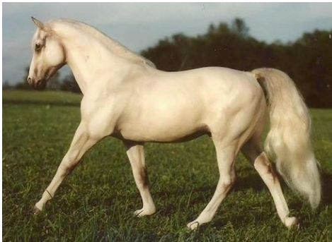
CHAMPION SPORT BREED: POLTER- GEIST (AC)

Other Pure or Mixed Sport Breed (12): 1-Blank Stare (SR), 2-Sunshine's Hardcore Chocolate (AC), 3-Sundown McMoon (AC), 4-DQ Konocti's Jet (CV), 5-The Mad Cookie (CV), 6-Outlasting The Blues (AC), 7-Blood Music (CV), 8-Tug Hill By Design (CM), 9-Cherokee Rose (JV), 10-Bag Lady (LK), HM-TS Fire On The Mountain (MP)