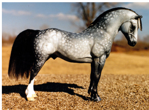
RES. CHAMPION PONY/MINIATURE HORSE: SOLDIER BLUE (AC)

Longear (4): 1-Belle Kabong (AC), 2-Sweet Adelaide (CV), 3-O Karen (CV), 4-Ironwood Glenn (SS)