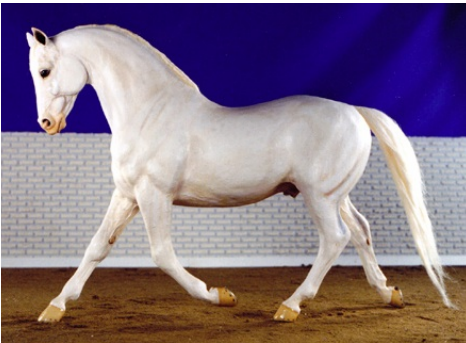
RESERVE CHAMPION SPANISH BREED: REI (AC)