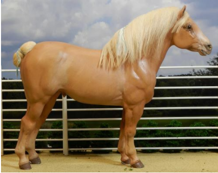
RES. CHAMPION DRAFT BREED: CHARLEROI (MH)

American Pony (7): 1-Diamond Playtime (CM), 2-Brookridge Danton (CV), 3-Lady Jessica (CV), 4-Jokers Dice (AC), 5-Wrang Bo Deedy (AC), 6-Scout (AC), 7-Black Hand (CV)