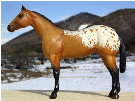
CHAMPION CUSTOM W/FACTORY PAINT: BANG IPPONGI (AC)

Retouch/Partial Paint Removal/Etch on Factory Paint w/Non-Factory Mane/ Tail and Remake and Retouch/Partial Paint Removal/Etch on Factory Paint w/Non-Factory Mane/Tail: no entries