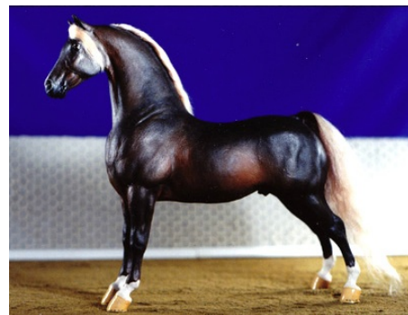
CHAMPION EXTREME REMAKE/REPAINT/ HAIR OR SCULPTED MANE/ TAIL: SYMPATHY FOR THE DEMON (AC)

M/T: Smaller than Classic (5): 1-Anise (BR), 2-Queen's Gambit (JC), 3-Whippoorwill Drop Dead Fred (BR), 4-DQ April Whisper (SS), 5-Cowboyography (VM)