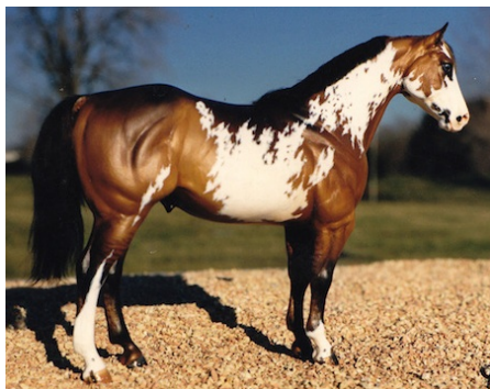
CHAMPION MAJOR REMAKE/REPAINT/HAIR OR SCULPTED MANE/ TAIL: MARS FLASH (AC)

1-Strange Meadowlark (AC), 2-In Lieu Of Cartier (BR), 3-Moonlight Cocktail (CV), 4-Vijelie Noptii (BR), 5-Lykke (AC), 6-WBP Jolly Roger (LeB), 7-Cast Iron Slew (AI), 8-Cast Iron Bull (AI), 9-Bonfire Vision (LeB), 10-Ridley (LK), HM-Nobel Heart (HC)