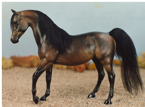
CHAMPION SIMPLE REMAKE/REPAINT/ HAIR OR SCULPTED MANE/ TAIL: AMOUR (KO)

Mane/Tail: Smaller than Classic (4): 1-Not Now Ni-San (AC), 2-Going Formal (BR), 3-Nightshade Primrose (HC), 4-WV Cotton Top (AL)