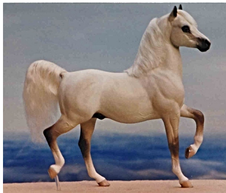
3-Scimitar's Ebony Flame (CM), 4-MCM Lost In Emotion (SR)

Stallions (4): 1-White Comet (LeB) [pictured at top of next column], 2- Ebony & Ivory (CM),