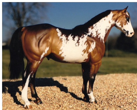
CHAMPION STOCK BREED: MARS FLASH (AC)

Other Pure or Mixed Stock Breed (17): 1-Nemesis (LeB), 2-Strange Meadowlark (AC), 3-Jimini (MH), 4-D.O. Copper Dust (MH), 5-D.O. Ridge Runner (MH), 6-Marshall Mellow (SC), 7-D.O. Sabre Dance (MH), 8-Lacey Lady (MH), 9-Aby Normal (SC), 10-DO Dun IV (JV), HM-Rapid Response (LeB)