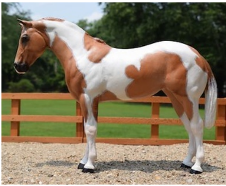
RESERVE CHAMPION FLOCKED/OTHER CUSTOM: DREAM ALL DAY (AI)

1990s WORKMANSHIP DIV. OVER-ALL CHAMPION: TECH NOIR II (AI)