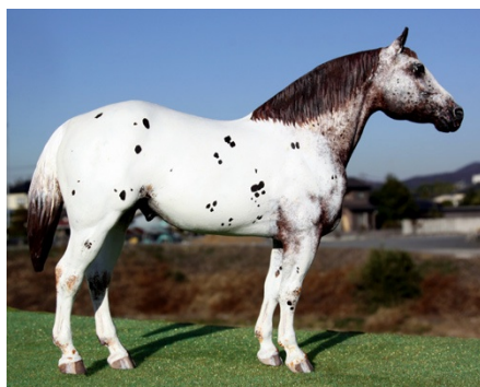
CHAMPION PATTERNED COLOR: TINY HARPER (AC)

Other Pinto Pattern (12): 1-Melulu (CV), 2-The Pied Viper (AC), 3-Singing Grass (CV), 4-Polaris (SS), 5-Maharajah (LD), 6-Tejas Treasure (VM), 7-Flashover (SS), 8-Hatahei (CV), 9-Triton Too (SS), 10-Scout (AC), HM-Jeet Kune Do (LD)