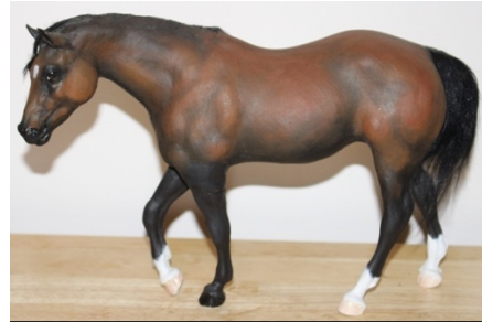
RES. CHAMPION MAJOR REMAKE/REPAINT/HAIR OR SCULPTED M/T: INDIANA JONES (LoB)

Extreme Remake & Repaint w/Hair M/T: Trad. or Larger (10): 1-Courtrai (MH), 2-Charleroi (MH), 3-Diamond Seonee (AC), 4-Rockledge Diamond Lark (CM), 5-Kandu Koho (AC), 6-Battleshoe Lori (AC), 7-Khedija (SS), 8-Diamond Fancy Cat (CM), 9-DQ Bint Rafflesia (AC), 10-Handsome Stranger (SS)