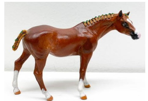
RESERVE CHAMPION REPAINT/HAIR OR SCULPTED MANE/TAI: WAITING FOR THE SUN (AC)

Simple Remake & Repaint w/Hair M/T: Trad. or Larger (132): 1-Asteroid Blues (AC), 2-Alias Jennie Jones (JC), 3-Fox Maiden (AC), 4-Crimson Cody (LoB), 5-Checkers' Leader (AC), 6-Apache Red Chief (CM), 7-Bean Bandit (AC), 8-Diya al Din (HR), 9-Haddon Hall Prospero (EH), 10-J's Enchanted Ecco (AI), HM-J's Indian Corn (CV)