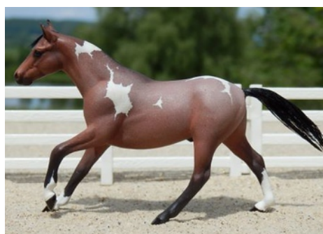
RES. CHAMPION REPAINT/HAIR OR SCULPTED M/T: WINE AND ROSES (BR)

Simple Remake & Repaint w/Hair M/T: Traditional or Larger (88): 1-Mona Lisa Overdrive (CV), 2-Showtime in Vegas (MH), 3-Seonee Elegy (AC), 4-PR Murphy Brown (JV), 5-Amantus VS (SR), 6-Rattlesnake Shake (AC), 7-Coronation (KO), 8-Artistic License (MH), 9-LJ Dream of Jackson (CV), 10-PR Khalifa Bint Sakir (JV), HM-LJ Heartlikeawheel (AC)