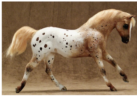
CHAMPION FOAL: MELULU (CV)

Jumpin Jiminey (SS), 3-Tommy Robin (AC) Light Foal (7): 1-Melulu (CV), 2-Kissawookie (LoB), 3-DQ Bint Rafflesia (AC), 4-Jasper (VM), 5-Ibn Sparkalot Plaudit (SS), 6-Moment In Time (CV), 7-Flora-scope (CV)