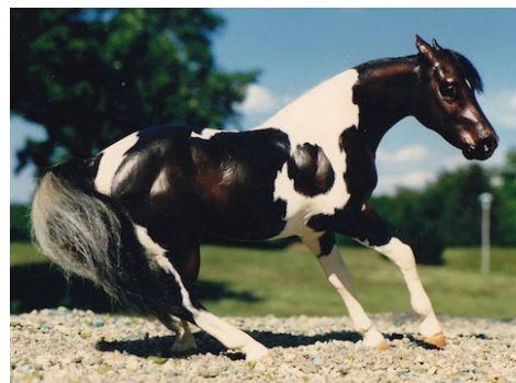
RES. CHAMPION EXTREME REMAKE/ REPAINT/HAIR OR SCULPTED MANE/ TAIL: THE AFRICAN SUN (AC)