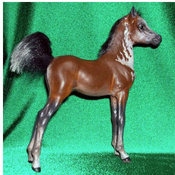
RESERVE CHAMPION FOAL: KISSAWOOKIE (LoB)

Draft Foal & Longear/Exotic/ Fantasy Foal: no entries