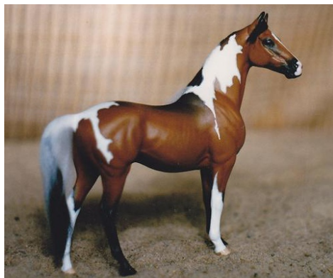
RES. CHAMPION SIMPLE R/R/HAIR OR SCULPTED M/T: SPARTACUS (LD)

Trad. or Larger (120): 1-Personal Effects (LD), 2-Sweet Jane (LD), 3-Metropolitan (AC), 4-Far Stars Burn (AC), 5-Dakota Shyster (LoB), 6-Amarna Bint Morafic (CV), 7-Angel Queen (CV), 8-Call to Glory (MH), 9-Flammable Jammies (AC), 10-Non-Stop Holiday (LD), HM-DQ Great Temptation (SS)