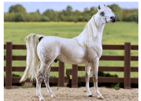
CHAMPION LIGHT BREED: TECH NOIR II (AI)

Other Pure or Mixed Light Breed (12): 1-All Dunn Up (LeB), 2-Cassata (MH), 3-Lady Yelena (LeB), 4-Carolina Girl (SS), 5-TS Desert American Queen (MP), 6-Kaleb (MH), 7-Red Hawk (SS), 8-PR Malika Siglavia (JV), 9-WBP Anastasia (LeB), 10-Dream Theater (SR)