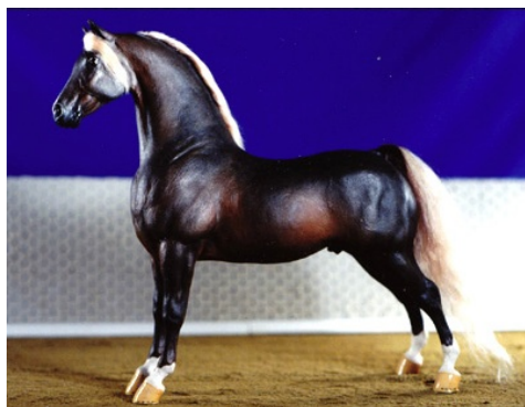
SYMPATHY FOR THE DEMON