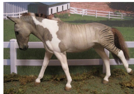
RESERVE CHAMPION LONGEAR/EXOTIC/FANTASY: ZAMBONI (HC)

Stock Breed Foal (30): 1-MN Solitary Boy (CV), 2-Without A Doubt (AC), 3-Luna Halo (AI), 4-Jettster (AI), 5-LJ Marissa (KO), 6-Moonchaser (AI), 7-Chantilly Lace (BR), 8-Shonen Champion (CV), 9-LJ September Skye (JV), 10-Blue Velvet (BR), HM-Angel (LB)