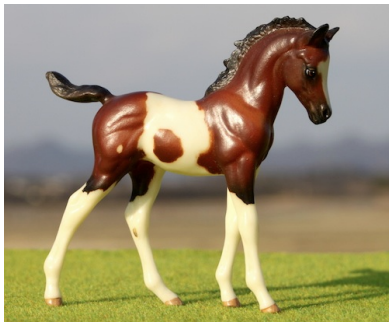
RES. CHAMPION CUSTOM W/FACTORY PAINT: STRATOKHASTER (CV)

Repaint: Trad. or Larger (52): 1-Arahael (LoB), 2-Loftus Jones (LoB), 3-Montana Cat (LoB), 4-Prince Of Denmark (SS), 5-Rhapsody Redford (LoB), 6-Such Are Promises (AC), 7-Zenith (LD), 8-Wild Eagle (LoB), 9-Avalanche (CV), 10-Castlekeep Mistress (LoB), HM-Abba (JC)