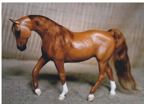
CHAMPION GAITED BREED: PERSONAL EFFECTS (LD)

Other Pure or Mixed Gaited Breed (10): 1-Wicked Speedia (AC), 2-Palomar Poco Lolita (JV), 3-D.O. Designer Colors (MH), 4-Mr. Majestic (SS), 5-AMB Midnight Frosty (AC), 6-Flashdancer (AC), 7-Quaint Keaton (AC), 8-Gold Standard (AC), 9-Gentleman Jim (SS), 10-Wings Of Magic (AC)