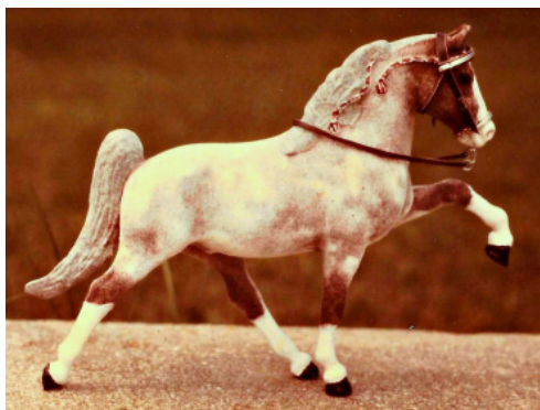
Gaited Breed (1): 1-Roaring Roan (CM)

Light Breeds & Sport & Spanish & Draft & Pony & Longear/ Exotic/Fantasy Breeds : no entries