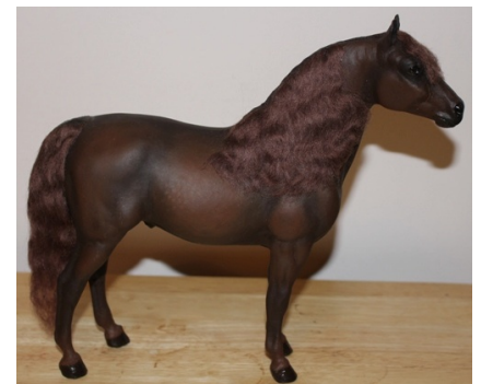
DAPPLE GREY (16): 1-Attn Evildoers (AC), 2-Wickenden Osprey (AC), 3-Sasaki (AC), 4-Follow The Moonlight (AC), 5-Millennium Falcon (AC), 6-*Quest (AC), 7-El Asombro (MH), 8-Metallic KO (AI), 9-Flying Fare (CM), 10-Fantasia's Silver Radiance (AC), HM-Cebion (MH)

5 | VCMEC Model Horse Re-View | Autumn/Winter 2025