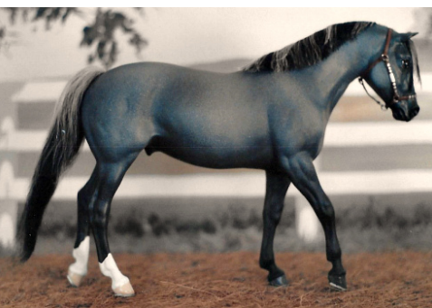
Geldings (2): 1-Sweet William J (CM), 2-Witchita Rock (CM)