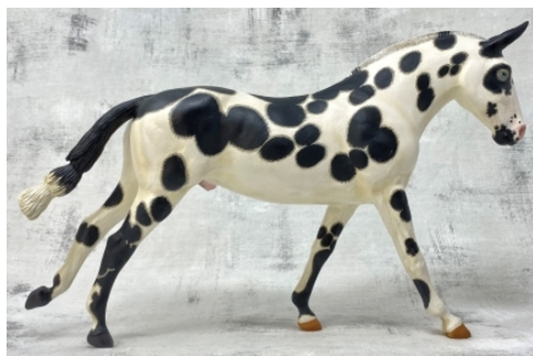
CHAMPION LONGEAR/EXOTIC/FANTASY: BILT TO BOOGIE (SC)

Fantasy Equine (5): 1-Hikaze (CV), 2-Llyr (CV), 3-TS Ramoth Of Riell (MP), 4-Prince Harry (HC), 5-Nobel Heart (HC)