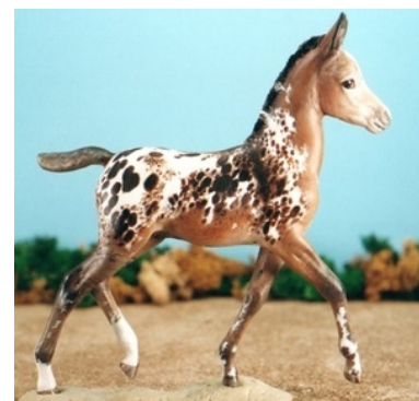
CHAMPION FLOCKED/OTHER CUSTOM: GET YOUR GROOVE ON (JC)

Any Other CM Not Listed Above (17): 1-Get Your Groove On (JC), 2-Dream All Day (AI), 3-Dark Naoto's Lil'I Squeak Toy Riot (AC), 4-Shamrock Elfin Magic (SS), 5-Cloud 9 (MH), 6-Under The Milky Way (AL), 7-Prince Harry (HC), 8-Ima Jetalino (SR), 9-Jewels (HC), 10-Valentino Splendida (AL), HM-Elite Colors (CV)