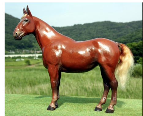
CHAMPION LONGEAR/EXOTIC/FANTASY: BELLE KABONG (AC)

Fantasy Equine (5): 1-Rheanth (AC), 2-The Scepter (AC), 3-Aquarion (AC), 4-Phantom F. Harlock (CV), 5-Carousel (HC)