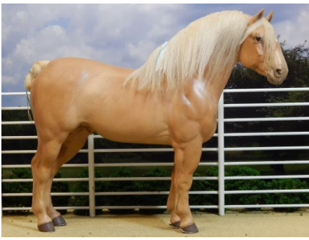
CHAMPION DRAFT BREED: COURTRAI (MH)