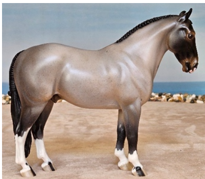
CHAMPION SPANISH BREED: JEMEZ HEEZAKEEPER (LeB)

Other Pure or Mixed Spanish Breed (20): 1-Jemez Heezakeeper (LeB), 2-Siglavý Seiko (CV), 3-D.O. Gunsmoke (MH), 4-LJ Zorro (MH), 5-Ice Queen (AI), 6-Estela (VM), 7-D.O. Sportin' Chance (MH), 8-KT Danza De Oura (CM), 9-Mallegena (CM), 10-RM Sophiia (CV), HM-TS Picante (MP)