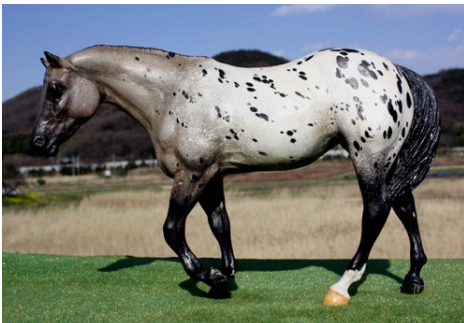
CHAMPION FLOCKED/OTHER CUSTOM: WATERS UNDER EARTH (CV)

Any Other Customization Not Listed Above (15): 1-Waters Under Earth (CV), 2-Antara Appalonia (LoB), 3-RM Miro (CV), 4-Poco Ladybug (CV), 5-Phoenixbrook (AC), 6-Sharakk Sei (AC), 7-Verano Sombra (SS), 8-Khehana (KO), 9-Ysengrin (AC), 10-La Cienka (AR), HM-Sweet Dreams (LeB)