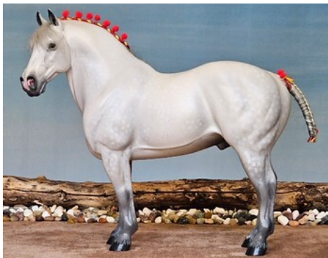
CHAMPION DRAFT BREED: JEMEZ SKYSTRIKER (LeB)

Other Pure or Mixed Draft Breed (21): 1-Atragon (AC), 2-Pippilotta-Elmar (JV), 3-TS Dragon Knight (MP), 4-Shoulda Had A Fifth (LeB), 5-Ellis (SR), 6-Tolleshunt Darcy (JV), 7-Demetrius (LeB), 8-WV Heza KO (LeB), 9-Nimbus (AC), 10-Loic (LeB), HM-DO Bessancour Moulin Rouge (JV)