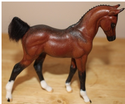
RESERVE CHAMPION FLOCKED/OTHER CM: ANTARA APPALONIA (LoB)

1980s WORKMANSHIP DIVISION OVERALL CHAMPION: AMOUR (KO)