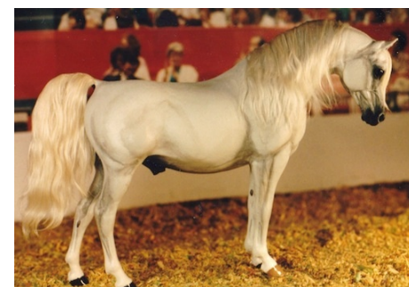
RESERVE CHAMPION EXTREME REMAKE/REPAINT/HAIR OR SCULPTED M/T: RM PRAVDA (CV)

Flocked w/Flocked M/T and Remade & Flocked w/Flocked M/T: no entries