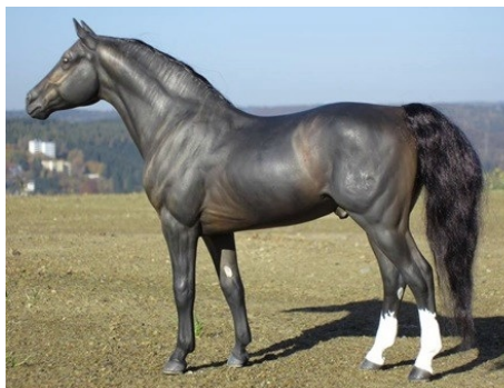
Amigo (HC), HM-PR Balenciaga Brio (JV)

Paso Fino/Peruvian Paso (12): 1-Bolero (LeB), 2-TS Jalapeno (MP), 3-TS Crystal Conchita (MP), 4-D.O. Brista Callienta (MH), 5-Fandango (AI), 6-Marguesa (CM), 7-City of Gold (CV), 8-LJ Abricotine Bleu (JV), 9-Noche Estrallado (SS), 10-Lad