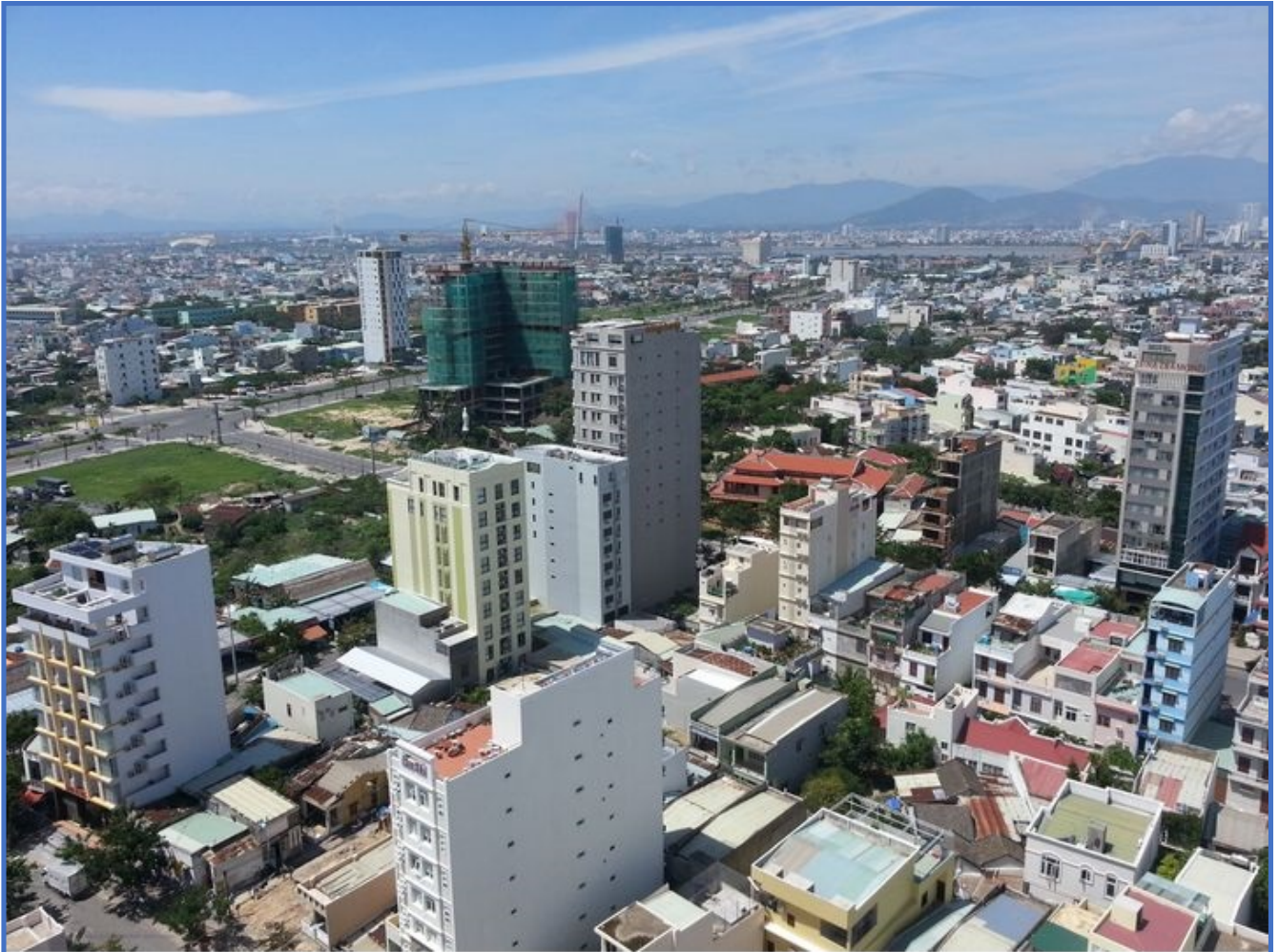
Part of Da Nang City looking west from the top floor pool and bar.