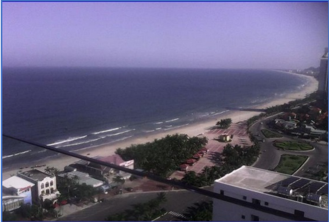
A closer view of one of the two new towers.