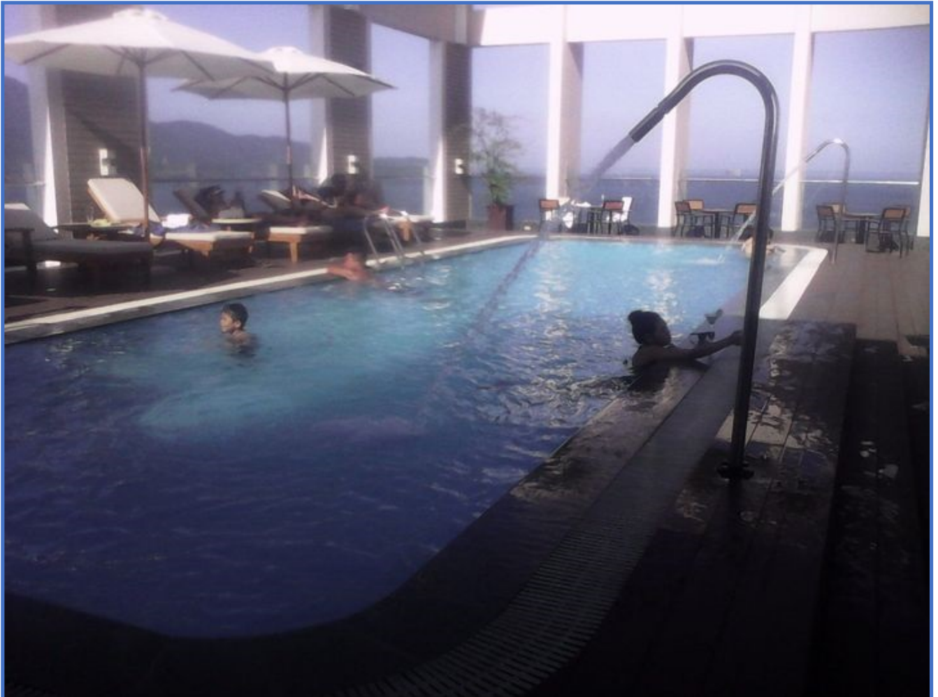
The top floor pool and bar. (Must have been a rough tour of duty!)