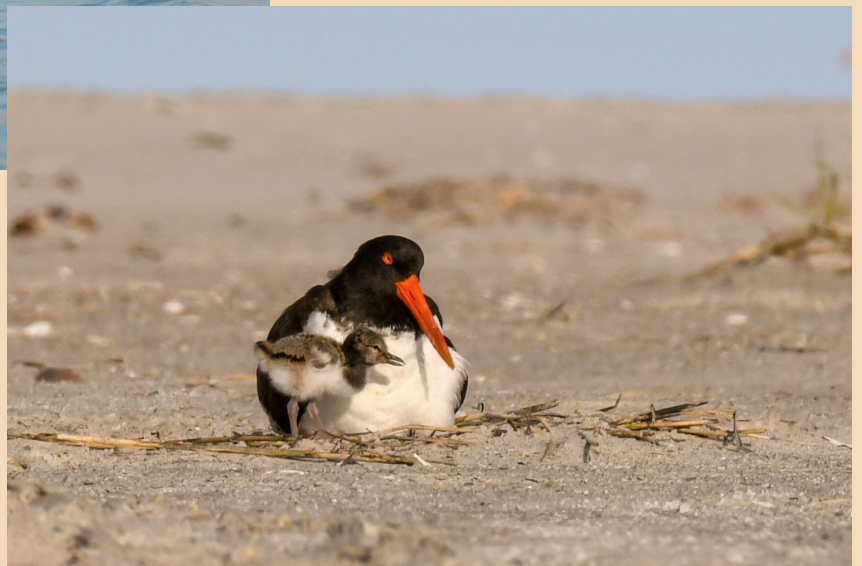
American Oystercatchers nest on our beaches every year but they are a declining shorebird and are an Endangered and Special Concern Species