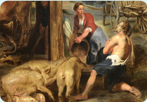
THE PRODIGAL SON, PETER PAUL RUBENS

There was a pop theatre production...about the prodigal son.... [The son writes a letter]: “Father, I have repented, I want to come back home.... If you want to welcome me, please put a white handkerchief in the window.” And when he was near home...what did he see? Not one handkerchief: it was full of white handkerchiefs, the windows, everywhere!