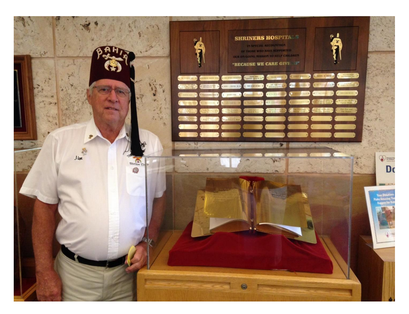
Lobby of The Shriners Healthcare for Children—Florida

The "Gold Book" and the "Because We Care" Gifts Plaques.