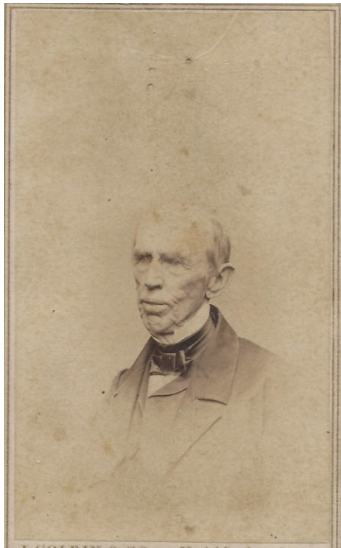
Francis P. Blair (1791-1876), Member of Jackson’s New Kitchen Cabinet

The venom he feels is directed particularly at John Calhoun.