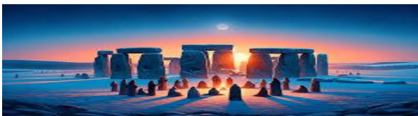
Winter Soltice 12/21 Shortest day of the year