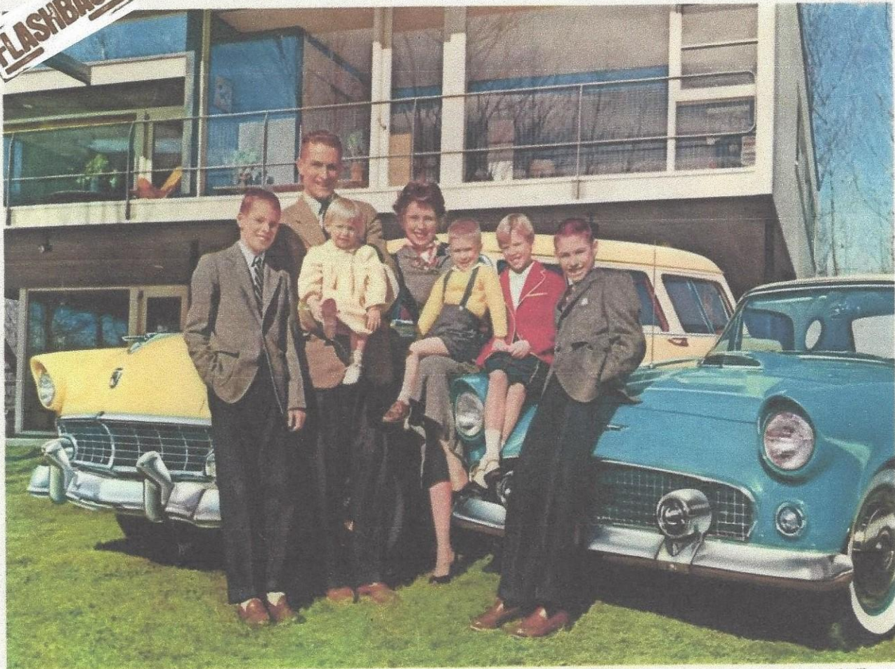
The only problem in posing this picture was getting the two Fords to stand still.