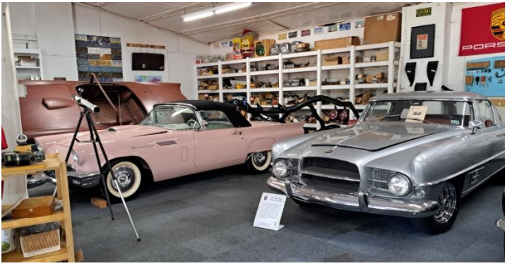
NOS body at the left, frame at back