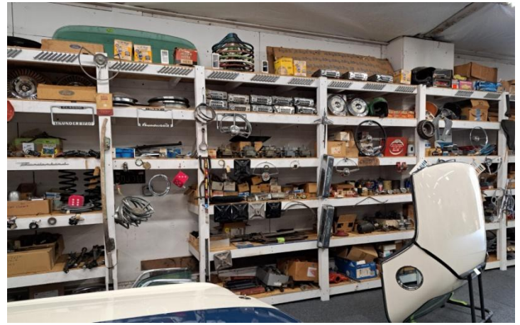
Parts anyone? Just a small sample