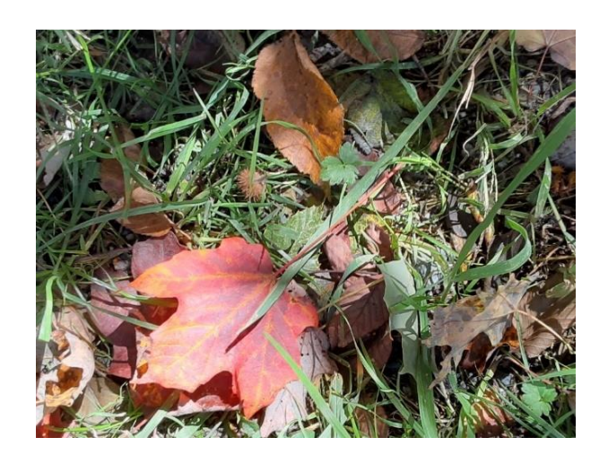
The leaves are changing!