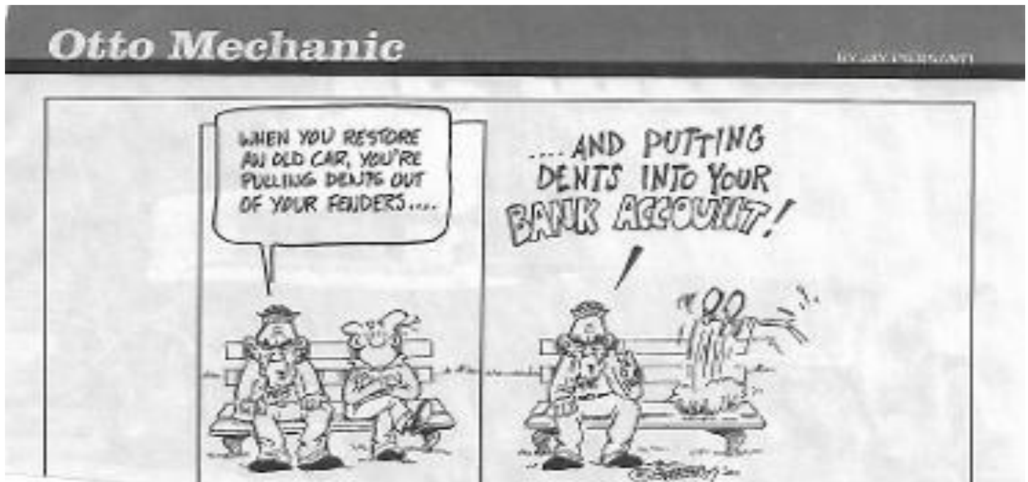
From Old Cars Weekly

While mask mandates are somewhat relaxed, they are not all gone because of the Delta variant. They are required in certain places. And if you're one of those people that think the vaccine is a hoax, then you should still wear a mask so you won't infect the like minded others when you come down with Covid 19. Over 97 percent of new cases (and deaths) are unvaccinated people.