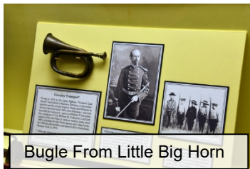
Bugle From Little Big Horn

interpretive exhibits, period artifacts from military life and a video presentation on the Indian scouts that served during the Indian War era.