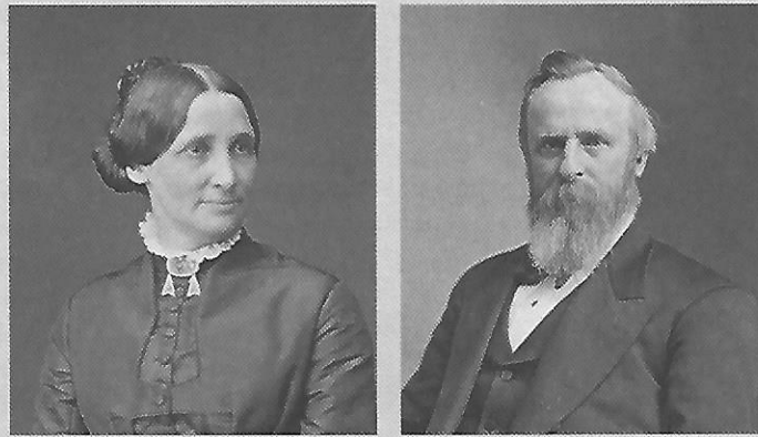
Mrs. Rutherford B. (Lucy Webb) Hayes and President Rutherford B. Hayes.