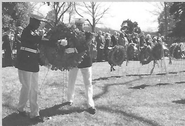
Marines place the Presidential Wreath at James Madison's grave during the commemoration ceremony at Montpelier on March 16, Madison's birthday.

Today, visitors to Virginia number in the millions and their economic impact is huge. Virginia tourism generated over $19 billion in revenue and supported over 210,000 jobs for the Commonwealth last year. Unlike the earliest attempts to attract travelers here, today's marketing campaigns highlight what's really here, and visitors' expectations are not only met, they are exceeded. Industry experts repeatedly report that heritage tourism is a strong niche market, and that today's traveler seeks out historic sites as well as natural, scenic beauty. Last year, the Blue Ridge Parkway (not a mall or an amusement park) was the number one attraction in Virginia. This is a wonderful trend for Orange County which sits in the midst of one of the most beautifully scenic, historically significant regions in the state. And, unlike those first visitors, today's travelers will be graciously welcomed and won't be disappointed!