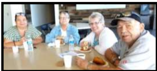
Phoenix North PNP Group