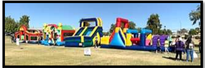
The DVPNBWO provided five huge Inflatables and the Carnival Games!