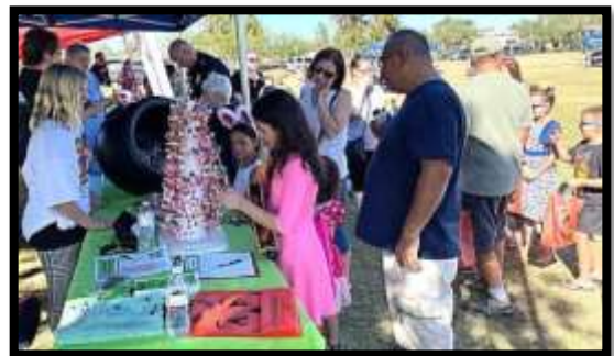
The Lollipop Tree