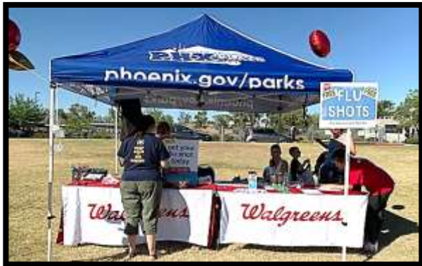
Walgreens did Flu Shots and the Fire Department gave away free Smoke Alarms!