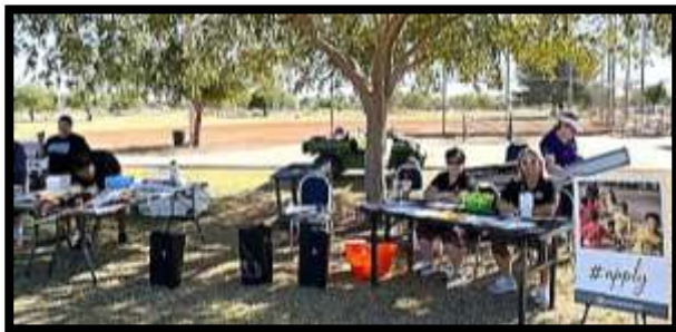
The DVCC sold Hot Dogs, Chips and Cotton Candy!