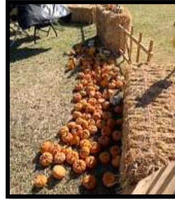
The Pumpkin Patch!