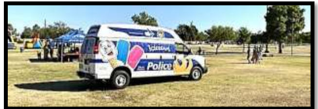
The Phoenix Police "COPSICLE VAN" brought goodies for all!