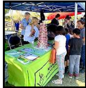
The DVPNBWO & MVGBW provided Toys, Candy and Crime Prevention & Safety Items to over 300 in attendance!