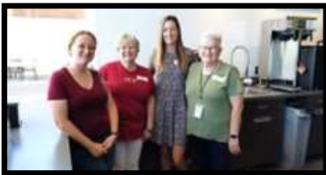
The awesome CCV Kitchen Crew