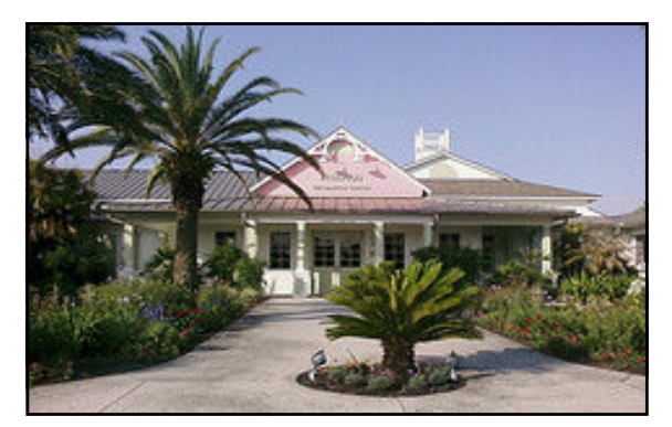
MEETING PLACE OF THE VILLAGES SHRINE CLUB Hibiscus Recreation Center 1740 Bailey Trail, The Villages, FL