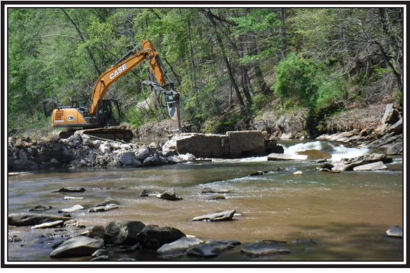
Drill and Broken Segments 4/25/2022

The dam removal will increase recreational use, and kayakers have already floated through the old dam site, now a class one rapid. This dam removal on the Blackwater River will also contribute to FORVA's efforts to create a Franklin County Blueway, now starting up, which includes both the Pigg and Blackwater Rivers.