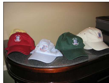
Stylish Baseball Caps