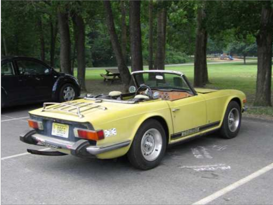
TR-6 in the parking lot at a Jaguar Show at Schooley's mountain