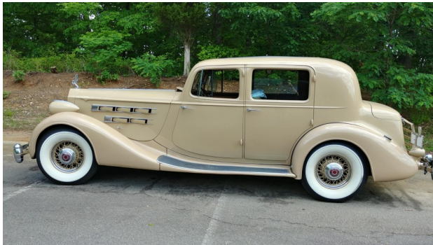
1935 12—Miles White