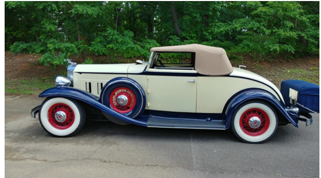
1932 Light Eight—Bob Montague