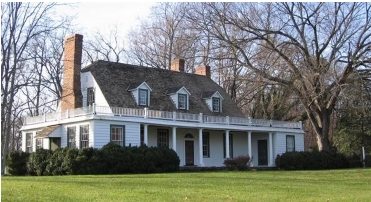
Rippon Lodge Woodbridge, Va.