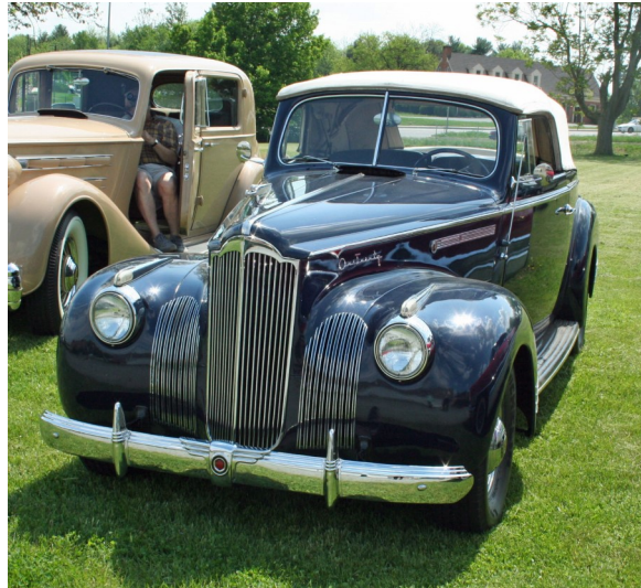
1941 120—Bill Aske