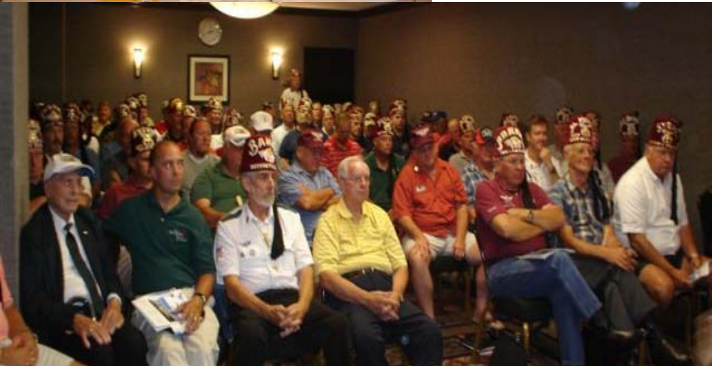
During the Int... a bike ride to