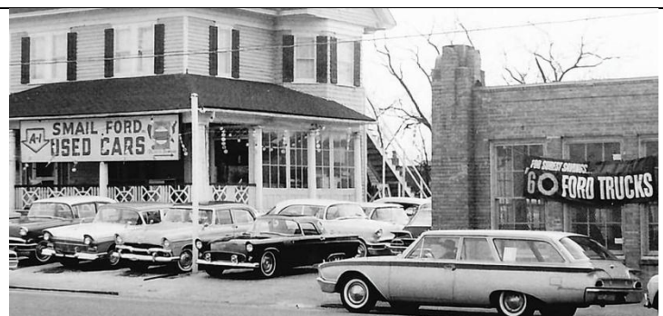
60's Ford Dealer - TBird was just another used car