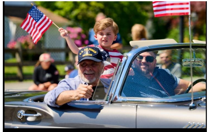
Three generations of Notars in Memorial Day Parade