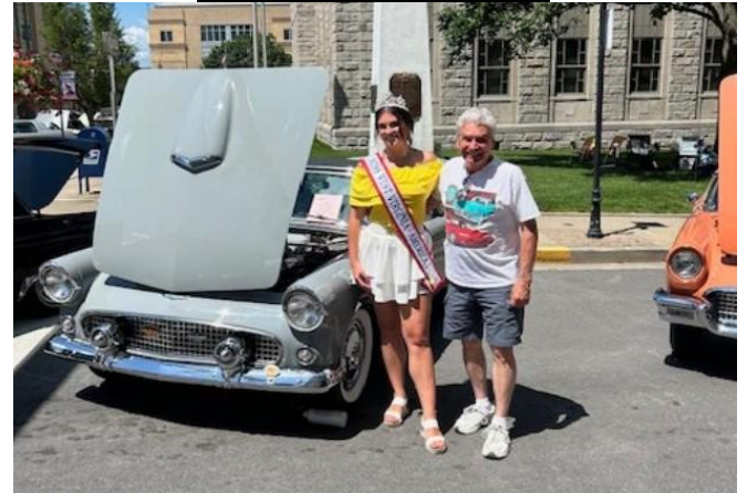
AACA car show Beckley, West Virginia Great show! HMM - Where's Donna?