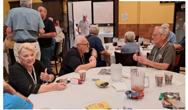
A couple of random shots of club members that were sent to me.