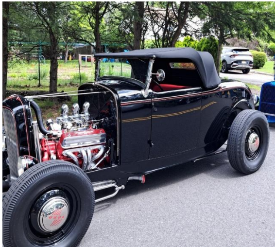
Liked this 32 - Y Block

Your editor attended this show. . Just a few shots