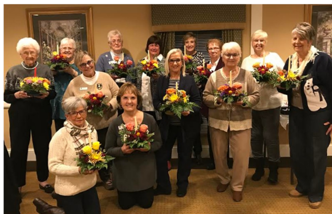
The photo above was taken at the October dinner where Soroptimists served over 40 women, children, and staff.

SI Middletown supports the Hope House Center for Women and Children regularly. We donate items monthly, everything from shampoo to sheets and towels and clothing. We have donated over 200 pillows so the women and children can take their pillows with them when they leave the center. This year we will also be serving dinners periodically.