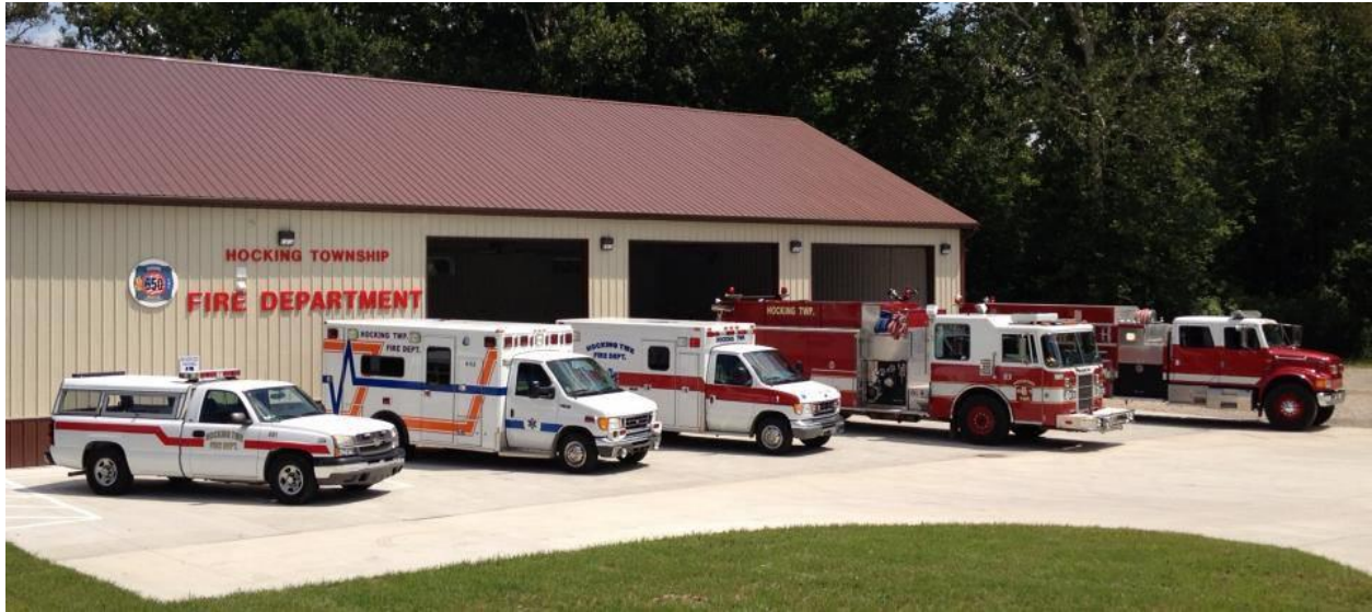
Grass 651 Medic/Squad 652 Medic/Squad 651 Engine 651 Engine/Tanker652