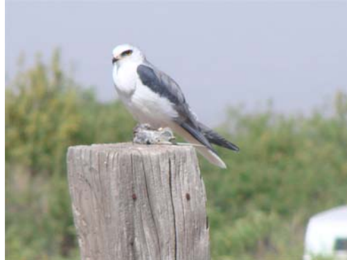
WHITE - TAILED KITE

Other rare species seen during the count were; Zone-tailed Hawk, Virginia Rail, Least Flycatcher, Blue-headed Vireo, Lucy's Warbler, and Golden-crowned Sparrow.